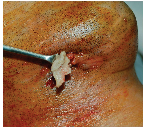
Figure 7 Bone sequestrum removed.