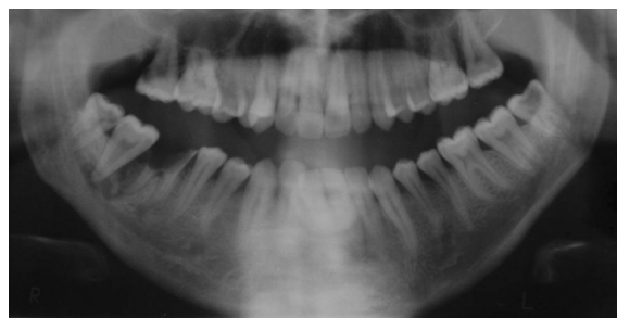
Figure 1 Panoramic view before the extraction of tooth 46.

submandibular and submasseteric region right for 2 months after the extraction of his tooth 46 (Figs. 1, 2). He had undergone treatment to his general dentist because of an incomplete healing during the post-extractive period, but there was no relief. Although the swelling was intermittent, the nature of pain was constant, extending to the mandible from the posterior region to the chin and, inferiorly, to the lower border which aggravated on eating food. On general examination, the patient was pale and weak also because of his poor nutrition. The cone beam computed tomography revealed the sequestrum formation that required surgical treatment (Figs. 3, 4); an extra-oral examination of the right side emphasized a mobile swelling which