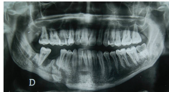
Figure 3 Panoramic view after the extraction of tooth 46.