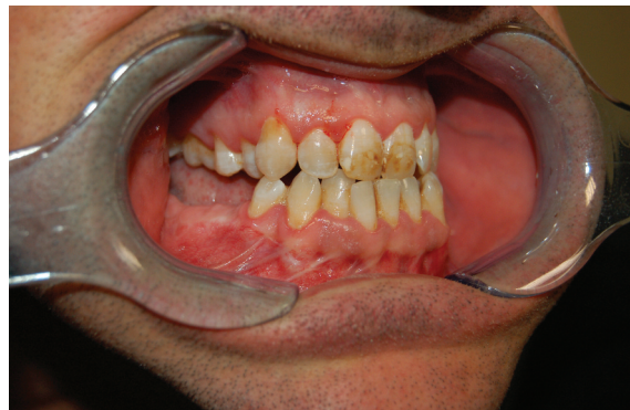
Figure 9 Clinic healing after 3 months from surgery.