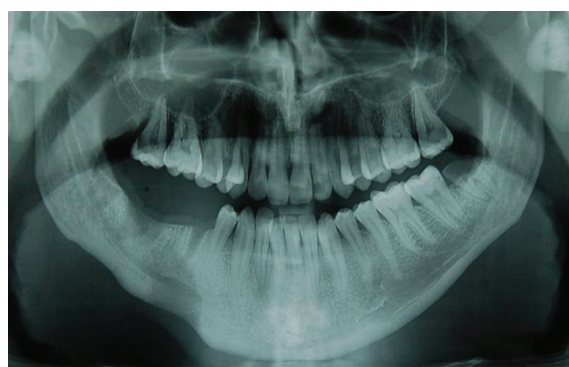
Figure 10 Panoramic view showing healing of bone tissue.

Marx and Mercuri (1991) were the first and only authors to define the duration of an acute osteomyelitis until it should be considered as chronic. They set an arbitrary time limit of 4 weeks after the onset of diseases (4). Acute and chronic osteomyelitis are much more relevant in the mandible than in the maxilla because of its poor vascularization and also because the dense mandibular cortical bone is more prone to damage and, therefore, to infection at the time of tooth extraction (7). The overall incidence of mandibular pyogenic osteomyelitis is up to 3 to 19 times greater than maxillary cases (8). In the mandible, the most common sites of the osteomyelitis are the body followed by the symphysis, angle, ascending ramus and condyle (9). Both sexes are affected almost equally based on overall data from demographic studies (8). Chronic osteomyelitis