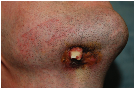
Figure 5 Extra oral photograph of the patient showing the expulsion of bone sequestrum.