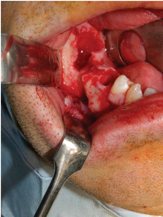
Figure 6 Intra operative photograph after extraction of teeth 45 and 47.