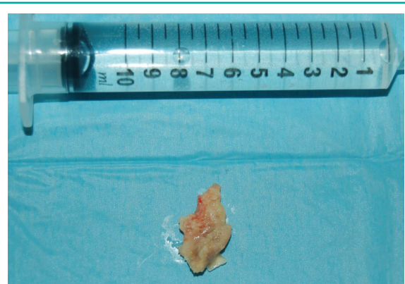
Figure 8 Bone sequestrum removed.

Culture reports revealed two microorganism, streptococcus viridans and staphylococcus that are sensitive to penicillin. So the patient started intravenous penicillin each day and therapy was continued for five weeks. Analgesics and clorexidine 0,2% mouth wash were prescribed. A regular recall