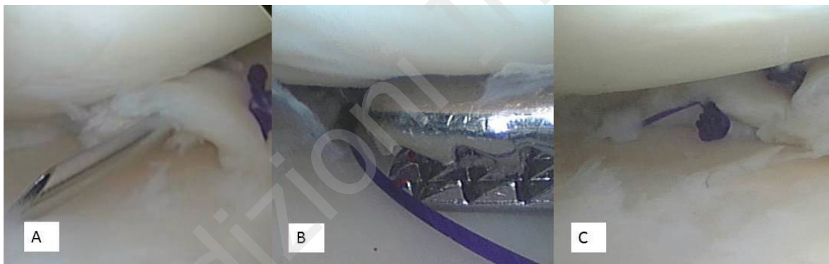
Figure 2. A,B: Insertion of a needle and of a polydioxanone suture through an anterior portal. C: Visualization of the mulberry knot.