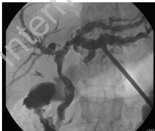
Fig. 2 - Cholangiographic control after stones removal.

ised by the presence of stones above the biliary confluence; it is prevalent in the Far East but increasingly occurring also in Western Countries such as USA (1). First description was from Vachell and Stevens in 1906 (2). Stones formation within biliary duct without associated disease is defined as primary, frequently observed in eastern populations where it is considered endemic, being rare in the West. Frequent is the association with strictures and deformation of the biliary tree: this causes recurrent cholangitis up to biliary cirrhosis with portal hypertension. Biliary sepsis, hepatic abscesses and cholangiocarcinoma are considered potential complications.