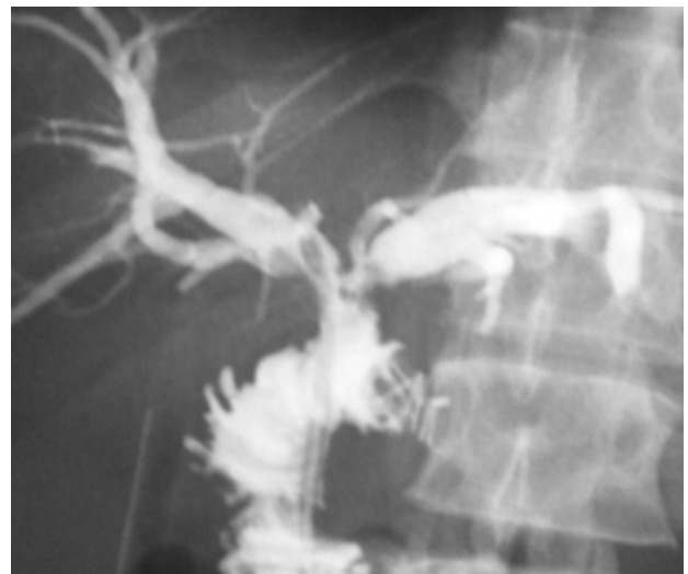
Fig. 2a - Detail of hepaticojejunostomy.