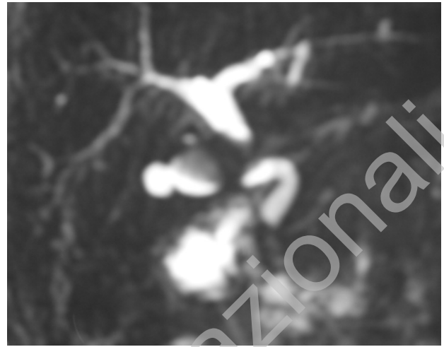
Fig. 1 - The magnetic resonance cholangiogram (MRC): a large gallstone in the gallbladder, no dilatation of the intrahepatic biliary tracts, no visibility of the middle part of common hepatic duct.

When the laparoscopic cholecystectomy has been performed, the gallbladder was found sclero-atrophic, enveloped by omentum and almost completely occupied by a single large stone. After removing the adhesions with omentum from the gallbladder, the hepatoduodenal ligament was opened. An anatomical structure going to the gallbladder was identified as the cystic duct; it was clipped and divided. While performing the dissection of the gallbladder bed, another duct