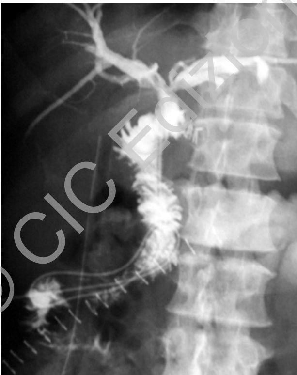
Fig. 2 - Postoperative cholangiography through the biliary stent which shows the reconstruction with Roux-en-Y hepaticojejunostomy without bile leakage.

A postoperative cholangiography through the biliary stent (Figs. 2, 2a) and a CT abdominal scan, executed after 10 days from