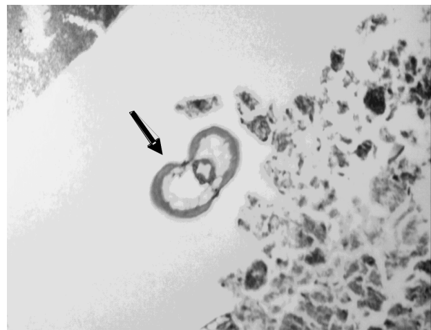
Fig. 1 - Ova of Enterobius vermicularis within the lumen of the appendix (H&E, 40x).