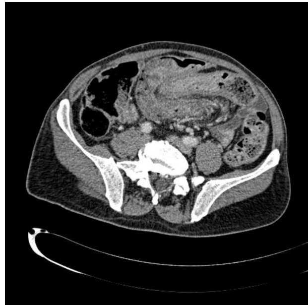
Fig. 1 - TC. Intussusception of sigma by carcinoma.

Some authors report a good sensitivity of ultrasonography in identifying intussusception. Images described as "pseudokidney" in the longitudinal view or as "target" and "doughnut" on the transversal view are suspicious (8-10). The known limit of ultrasound in urgency is the poor quality of the images if significant abdominal meteorism is present. The gold standard for the diagnosis of invagination is multislice CT (1, 4, 11-14) because it is able to demonstrate not only the presence of a mass but also to identify invagination, whereas colonoscopy alone may not be sufficient, especial-