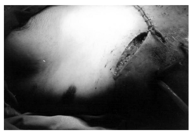
Fig. 1 - Skin hematoma by puncture for anesthetic intercostal blockade was observed in the same anatomic topography of the SHL.

Giants SHL may provoke hemodynamic instability