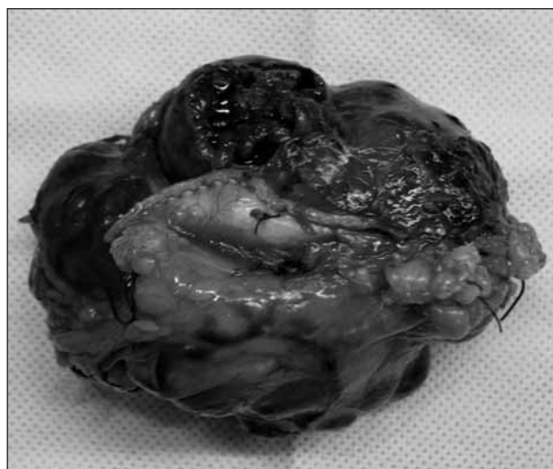
Figs. 3 - Resection and specimen.

white-cells (epithelioid) leiomyosarcoma, CMA++, SMA++, DES+/-, S100-, CD117-, composed of polygonal cells with either eosinophilic or clear cytoplasm. Moderate cellular and nuclear pleomorphism, and mitoses were observed (> 5 x 10 HPF). The tumor was attached to the muscular layer of the gastric wall sparing the mucosal and submucosal layer. Spindle cells were microscopically confirmed to arise from the muscularis propria of the stomach. Many areas of cystic degeneration and haemorrhage were found (Fig. 4). The tumor appeared to have been completely resected (R0 resection) with no evidence of tumor spreading to the adjacent structures (hyperplasia of peritoneal mesothelial cells) or metastases into the 12 examined lymph nodes (chronic reactive aspecific flogosis).