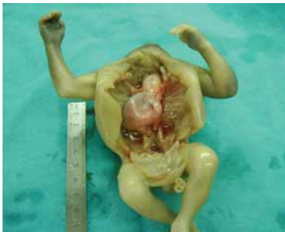
Figure 2 Posterior mediastinal cyst between diaphragm and lingua.