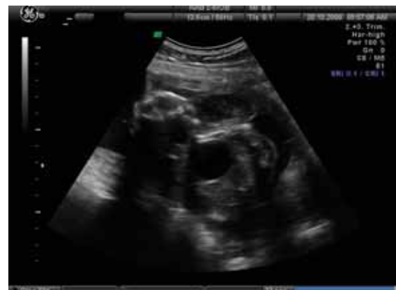
Figure 1 Ultrasonographic image of the fetus with posterior mediastinal unilocular anechoic cyst.

Necropsy revealed a 180 g, 18-week-old male fetus, the crown-heel length was 21 cm. The head was retroflexed with cervical vertebrae agenesis, anencephaly with iniencephaly, the cranial skin was continuous with lumbar skin and spina bifida extending from cervical to lumbar region