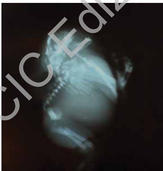
Figure 4 Post-abortion X-ray of fetus showed severely deformed spinal vertebrae and costae, absence of cervical vertebrae and fusion of occipital bone and back.

was observed. One millimeter interventricular septal defect was present and he had an interesting bronchogenic cyst (4x1 cm) extending from diaphragm to lingua in the posterior mediastinum (Fig. 2). Bronchogenic cyst had ciliated columnar epithelial lining and wall composed of smooth muscle and fragments of cartilage (Fig. 3).