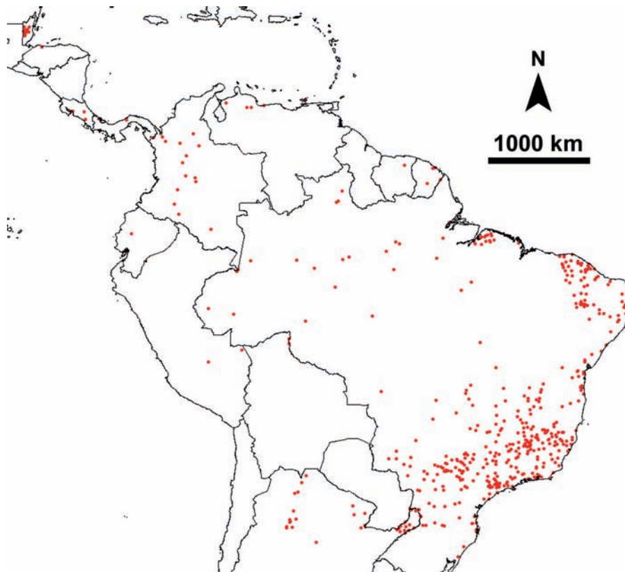
Fig. 2. Map of collection points for multiple species that were georeferenced from Martins et al. (1978) and now are available in SandflyMap.

Expert opinion maps for visceral, mucocutaneous, cutaneous ( Leishmania major ) and cutaneous ( L. tropica ) leishmaniasis (WHO, 2010) have been included in SandflyMap. The map reproduced in SandflyMap is a re-rendered version of those available on the WHO site and may contain errors of translation. Briefly, images were copied, georeferenced, then polygons created to encompass coloured areas of presence on the original map. These shapefiles were then converted to raster format at 0.05 degree resolution. The relation-