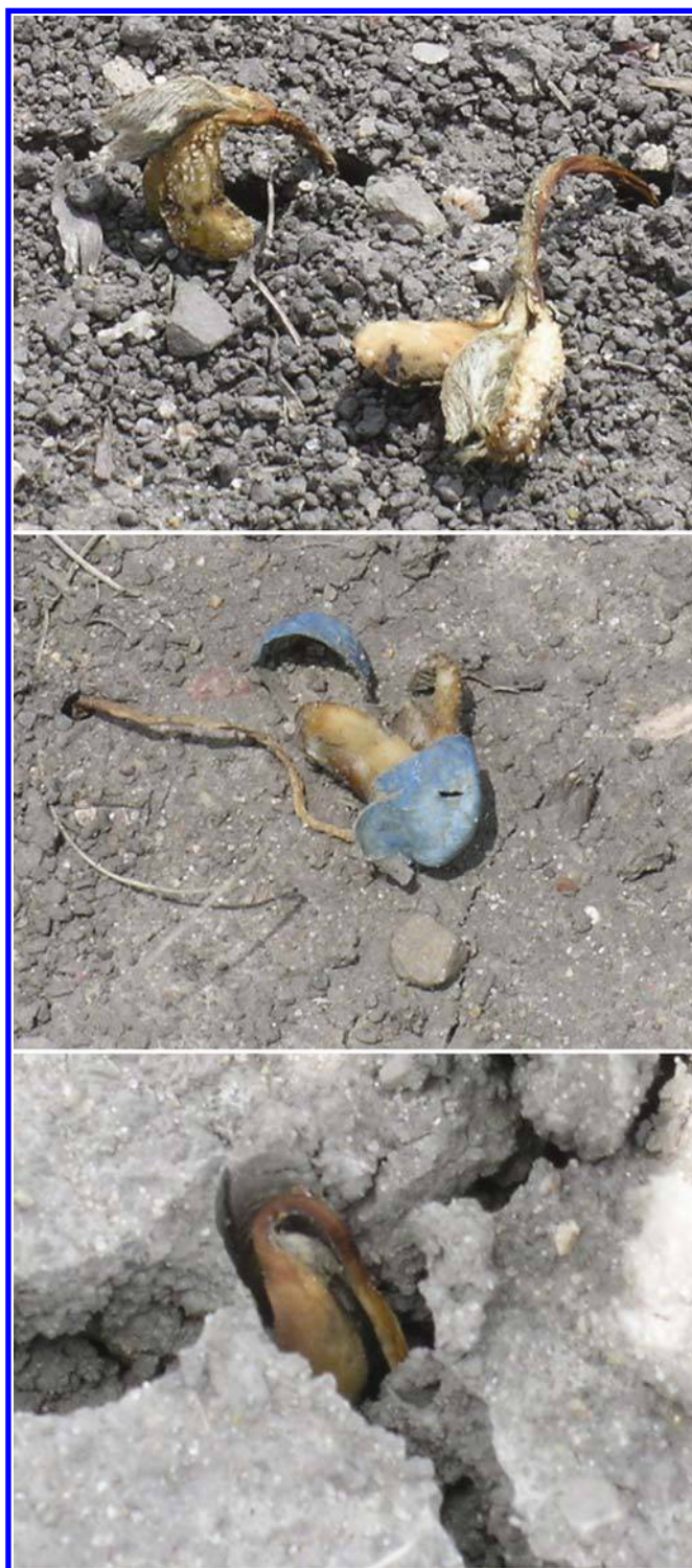
Fig. 2. Soybean seedlings with symptoms of damping-off caused by Phytophthora sojae on both treated and nontreated seed. Note the presence of seed coat above soil surface following germination of seedlings.

and candidate lines to root rot caused by P. sojae . P. sojae isolates from the field study locations contained a complex virulence formula as demonstrated by their ability to infect soybeans with Rps1a , 1k, 6, or 8 as well as additional differentials. In 2004, three seed treatments including mefenoxam, 3.75 g a.i. and fludioxonil, 2.5 g a.i./100 kg seed (Apron Maxx RTA); mefenoxam, 3.75 g a.i. and fludioxonil, 2.5 g