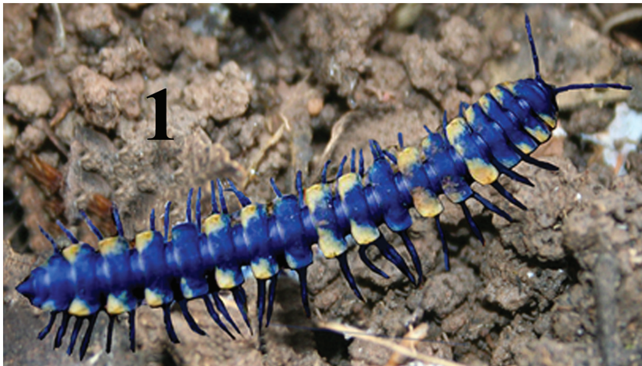
Figure 1. Tiphallus torreon , habitus photo showing in vivo dorsal coloration.

Color in life (Fig. 1). Dorsum and sides iridescent turquoise, lateral margins of collum and caudal paranotal corners on segments 2–18 with whitish areas varying from the tips and slight extensions along caudal margins on segments 6, 11, and 14, to large splotches covering caudal 2/3 to 3/4 of paranota on segments 5, 7, 9–10, 12–13, and 15–16. Epicranium medium turquoise, fading in interantennal and genal regions then darkening again on frons; labrum white. Pregonopodal sterna and prozonae dark to medium turquoise, fading on 7 th sternum between 9 th legs and only faintly blue thereafter. Legs