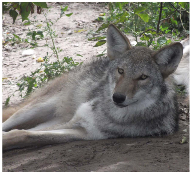
Figure 3. Facial view of two 6–7-month-old F 1 hybrids between a male, western, gray wolf and a female, western coyote resulting from artificial insemination.