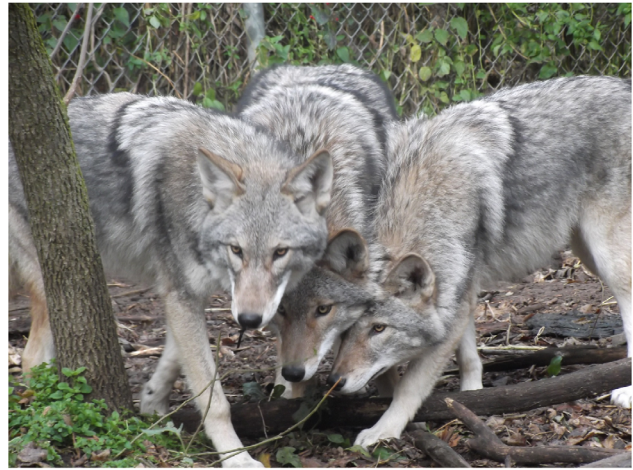
Figure 2. Three 6–7-month-old, littermate, F 1 hybrids between a male, western, gray wolf and a female, western coyote resulting from artificial insemination.