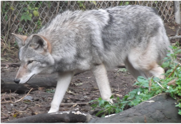
Figure 4. Side view of a 6-7-month-old F 1 hybrid between a male, western, gray wolf and a female, western coyote resulting from artificial insemination. doi:10.1371/journal.pone.0088861.g004