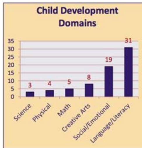
Figure 2. Child Development Domains.

Programs focused on early literacy and social/emotional development have important implications, not only to Extension's leadership role in early childhood professional development, but also in opportunities for cross-discipline collaboration. There is a growing body of scientific evidence identifying how early influences are essential to the development of children's brains and their lifelong health (Center on the Developing Child, 2010). Findings from the environmental scan suggest there are multiple programs offered through Extension teaching participants basic concepts of early brain development and how cognitive development influences, and is influenced by, social/emotional, physical, and language/literacy development.