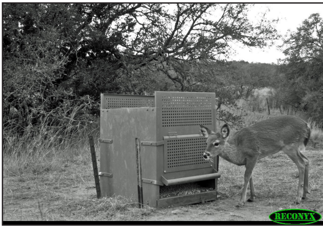
Figure 2. The HogHopper™ developed by the Invasive Animals Cooperative Research Centre in Australia and Animal Control Technologies Australia.

use the BOS™. During the second trial, investigators found that bait removal from the BOS™ was reduced by only 10% for feral swine when activated, whereas bait removal from the BOS™ by all other wildlife was reduced by 100% when activated (Campbell et al. 2011). Furthermore, 90% of the feral swine population had consumed baits delivered through the BOS™ and would have received a dose of the biologic, compared to only 13% of the raccoon population (Campbell et al. 2011).