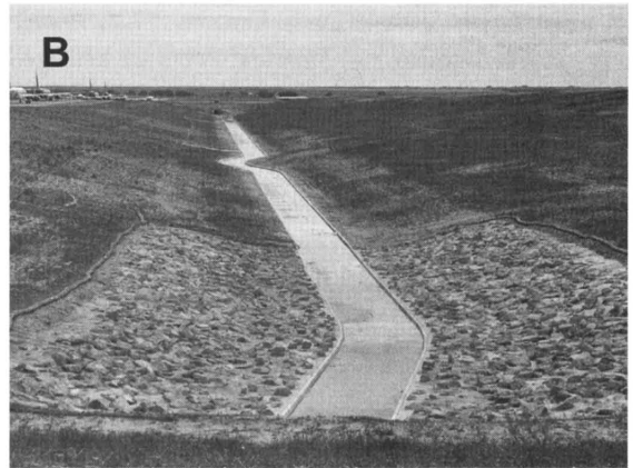
Fig. 9.4. Swale and conveyance system at Denver International Airport, Denver, Colorado, USA: (A) before and (B) after improvements to the channel.

also has added compost amendments to the soils to increase the effectiveness of pollutant removal, but the compost-amended soils attracted earthworms. If these soils are located next to paved operational areas, earthworms can invade the pavement during and after rains, providing a food source for birds (e.g., gulls). However, SEA found that using biosolids instead of compost amendments provided the high organic content for pol-