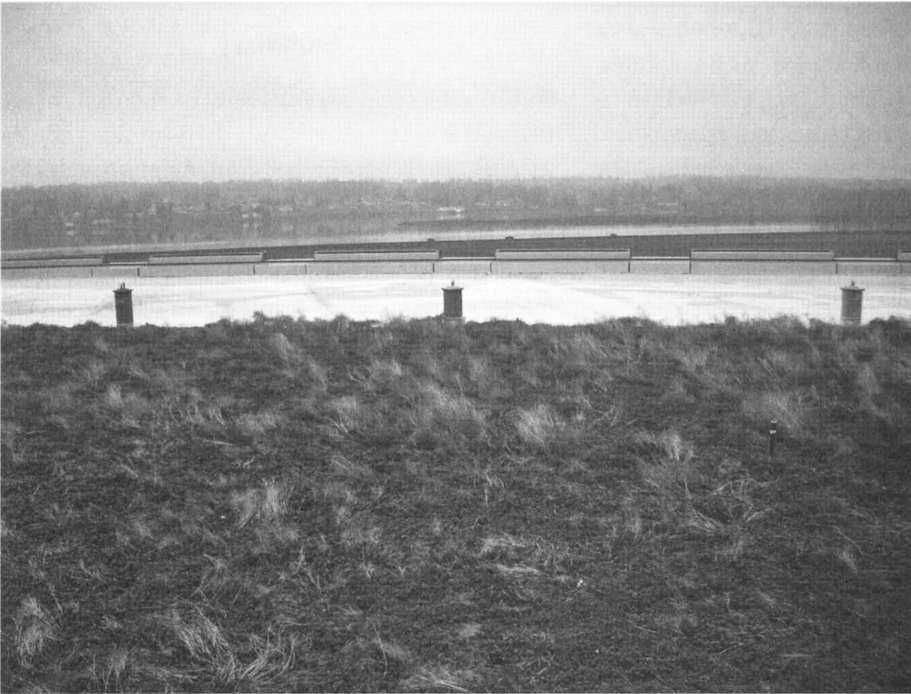
Fig. 9.3. Green roof at Portland International Airport, Portland, Oregon, USA.