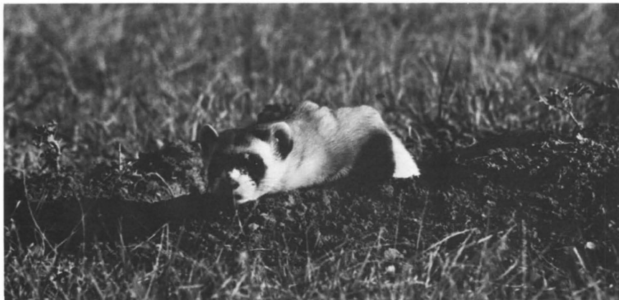
FIGURE 1. A black-footed ferret in a prairie dog burrow. Note distinct black mask and feet.

ONTOGENY AND REPRODUCTION. Aspects of the reproductive biology of captive ferrets were described by Hillman and Carpenter (unpublished manuscript). Captive females en-