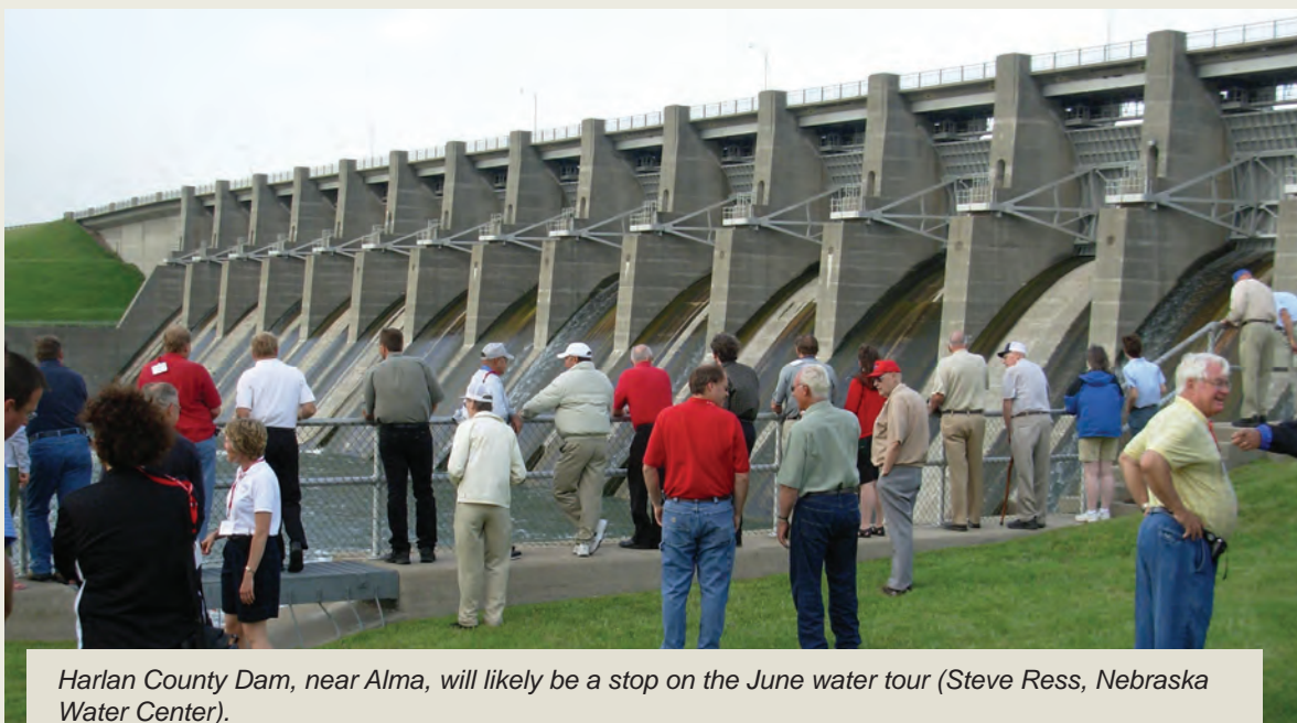
Harlan County Dam, near Alma, will likely be a stop on the June water tour.

Additional information will be posted online at watercenter.unl.edu and at facebook.com/NebraskaWaterCenter as it becomes available.