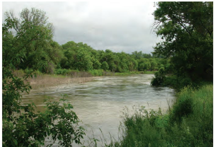
The Republican River in Nebraska (Steve Ress, Nebraska Water Center).

June 23-25 have been selected as the dates for the annual tour that examines current water and natural resources issues that are important to water users in Nebraska and surrounding states.