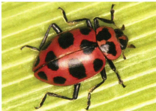
Figure 14. Spotted lady beetle

The Spotted Lady Beetle, Coleomegilla maculata (Figure 14). This is a native species especially common in southeastern Nebraska. It is the only species in this guide with a pronotum that is not black or white. Adults are medium-sized (5-7 mm), light to dark pink, and have two irregularly shaped black spots on a pink pronotum. Together, the elytra are somewhat almond-shaped and have 10 spots, some of which may be fused together. This insect is often noticed on flowers, where it sometimes feeds on pollen.