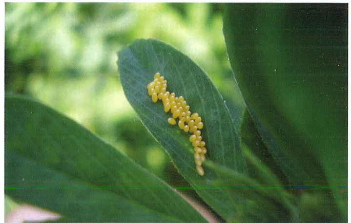
Figure 2. Lady beetle egg cluster on a leaf