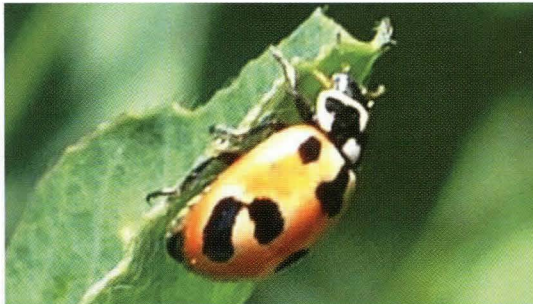
Figure 13. Parenthesis lady beetle

Parenthesis Lady Beetle, Hippodamia parenthesis (Figure 13). This native species is named for the patterns resembling parentheses on its elytra. It is an elongated, smaller beetle (4-5 mm), often found in prairie settings and overgrown areas. It moves very quickly when disturbed, often dropping to the ground and running under debris. It is not as common in Nebraska as most of the other species listed in this publication.