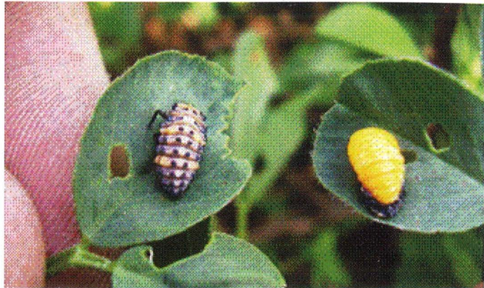
Figure 4. Prepupa and newly-formed pupa