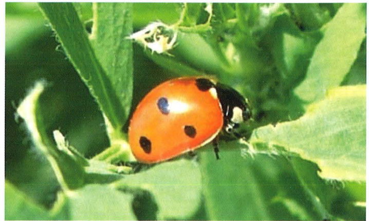
Figure 1. Adult Seven-Spotted lady beetle searching for prey

Lady beetles often lay their eggs on vegetation. They deposit them upright in clusters of 5 to 50 bright yellow eggs ( Figure 2 ). Just before hatching, the eggs darken. Once the tiny larvae hatch, they eat their eggshells, usually staying clumped together for a day or so before they crawl off in search of prey. They grow in four discrete larval stages called instars , and molt between each stage.