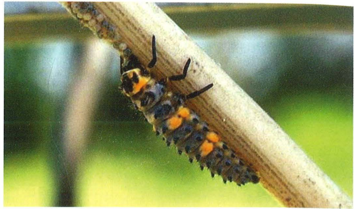
Figure 3. Lady beetle larva eating another insect's eggs

Lady beetles can be purchased commercially in large quantities for release, but this practice is not recommended as the lady beetles usually will fly away within a few days. Generally speaking, it is better to allow lady beetles to arrive of their own accord and to avoid practices such as the spraying of broad-spectrum insecticides, which hinder their success.