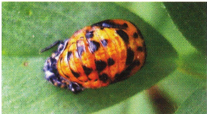
Figure 5. Mature lady beetle pupa