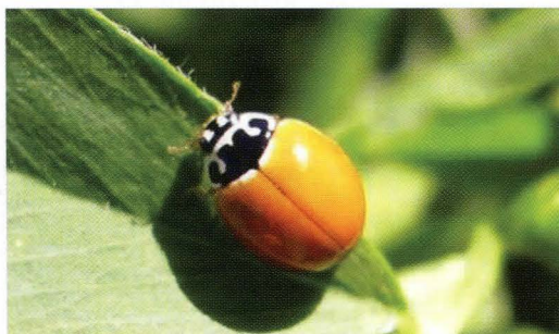
Figure 12. Polished or Red lady beetle

Polished or Red Lady Beetle, Cycloneda munda (Figure 12). This attractive beetle is smaller than some species (4-5 mm) and never has any spots. Its pronotum is white around the border, with two thin lobes extending into the black center. It is domelike in shape and ranges from tan to red. It is sometimes found in gardens, ditches, and fields.