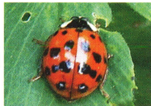
Figure 10. Multicolored Asian lady beetle. Note the variation in color and pattern on elytra and variations of the distinctive pattern on the pronotum.