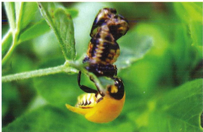
Figure 6. Newly emerged lady beetle adult hanging below pupal case