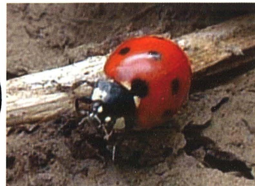
Figure 9. Seven-Spotted lady beetle

The Multicolored Asian Lady Beetle, Harmonia axyridis (Figure 10). This notorious lady beetle, native to China and Japan, is our most recent arrival in Nebraska. It is given its name because its elytra vary from yellow to brown, with a spectrum of oranges and reds in between. It may be covered in spots, or have no spots at all. Its most distinguishing characteristic is the pronotum. It is white with a solid or broken "M" shape in black, which separates two round white lobes on each side.