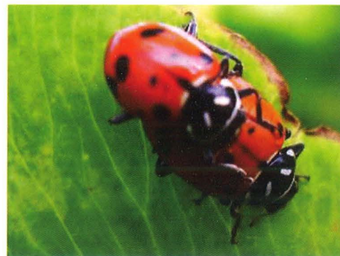
Figure 8. Convergent lady beetle

The Seven-Spotted Lady Beetle, Coccinella septempunctata (Figure 9). This large lady beetle, introduced from Europe, is the "classic" lady beetle depicted in images throughout the United States and Europe. It was released many times in the later part of the 20th century throughout the United States. It became increasingly common in Nebraska in the 1990s and may be displacing native species. Adults are robust and nearly hemispherical. Each individual elytron bears three spots, with one central spot near the pronotum, for a total of seven spots. The central spot is often highlighted with hazy white at the front, and the black pronotum is marked at the front corners with white.