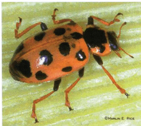
Figure 11. Thirteen-Spotted lady beetle

The Thirteen-Spotted Lady Beetle, Hippodamia tredecimpunctata (Figure 11). At the time of publication, this was the least collected lady beetle species listed in this publication. This species is native to Nebraska. It is elongate and orange with 13 round black spots evenly spaced on its elytra.