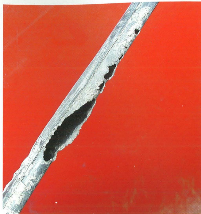
Figure 7. Damage to driplines caused by rodents.

An important concern with SDI in arid regions is that soil salinity above the driplines can increase with time. This problem, however, may take a relatively long time to develop and is not likely to occur in areas receiving enough precipitation at any given time to move the salts down in the soil profile. Another important factor when considering the danger of developing