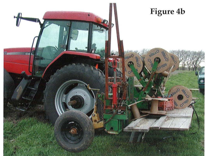
Figure 4a-b. Equipment used to install an SDI system.

ers who receive water from a canal system, water may not be available in early spring and late fall when SDI systems are usually installed. Although SDI systems are relatively easy to install in the rockless soils commonly found in Nebraska and other High Plains states, installing an SDI system in rocky soils, which are common in other places, could be difficult, if not impossible.