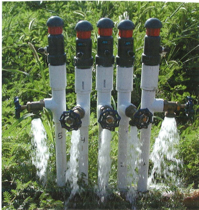
Figure 6. Flushing an SDI system.

if needed, a rodent control and prevention program should be implemented. This control program should include, not only the SDI field, but also the surrounding area to keep rodents from moving into the SDI field. Currently there are no clear guidelines on how to solve this problem, however, rodent problems seem to be more severe under dry conditions, therefore, keeping the soil surrounding the dripline wet seems to alleviate the problem. Others recommend applying certain chemicals to kill or repel rodents.