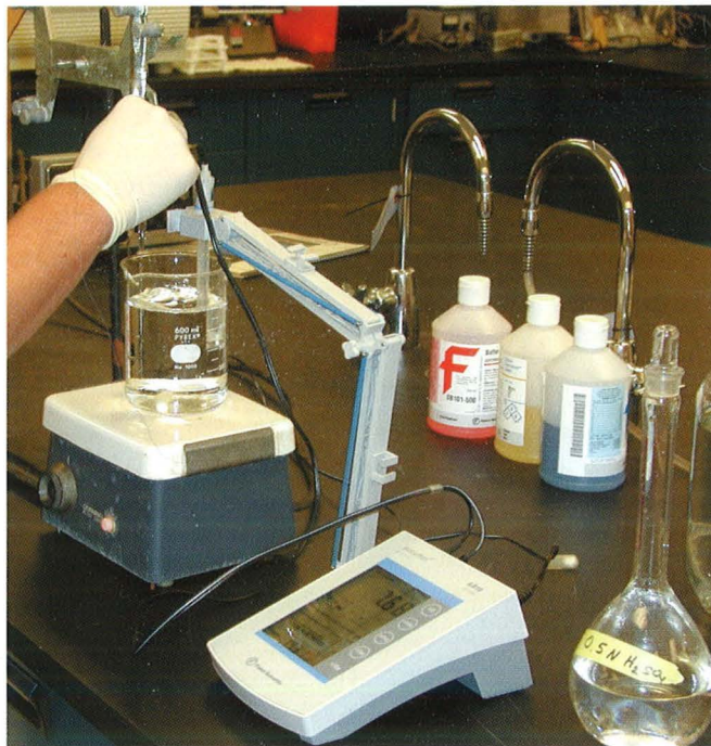
Figure 5. Testing water quality for SDI.

Although the proper filtration system will keep most soil particles out of the system, some particles will still pass through the filter and settle inside the driplines. These very small particles need to be eliminated by periodically flushing the system. Therefore, it is extremely important that the proper flushing system is included in the design. This usually includes