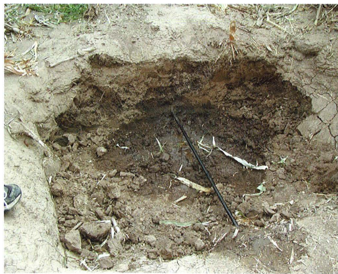
Figure 1. Dripline installed underground.

Subsurface drip irrigation (SDI) applies water directly to the crop root zone using buried polyethylene tubing, also known as a dripline, dripperline, or drip tape (Figure 1). Driplines come in varying diameters and thicknesses in order to maintain acceptable irrigation uniformity for different field lengths. Smaller diameter driplines are used when short lateral lengths are required. As lateral length increases, a larger diameter dripline must be selected to maintain adequate irrigation uniformity.