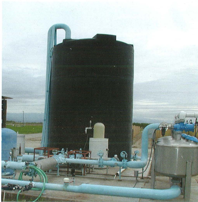
Figure 3. Water tank used to store water for an SDI system.