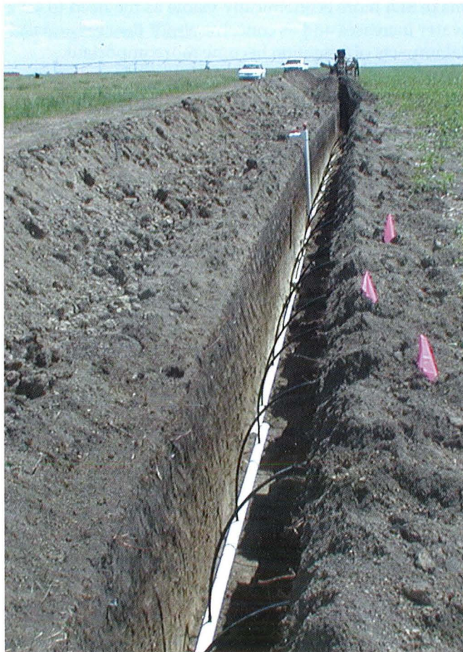
Figure 2. System installed underground.

Because the driplines are underground, SDI could be an alternative method for disposing of wastewaters, especially those with an unpleasant smell that do not adapt well to application using other methods. Although more research is needed, researchers at