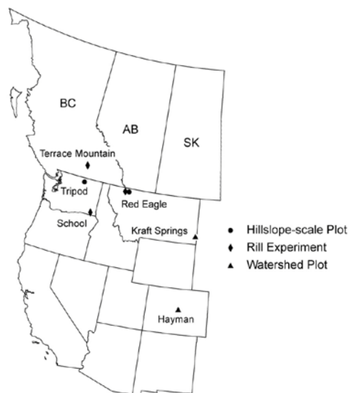
Figure 1. Post-fire salvage logging research sites in the northern Rockies. The Tripod and Red Eagle sites have sediment fences at the hillslope-and swale-scale; the Hayman and Kraft Springs sites have paired small watersheds ; and the rill experiments were conducted at Terrace Mountain, School, and Red Eagle.

All sites were characterized by moderate or high burn severity and the soil properties, topography, and vegetation types were documented. Rigorous data quality standards were used for all measurements including precipitation, disturbed area measurement, runoff, peak flow, sediment yield, ground cover, and soil water repellency.