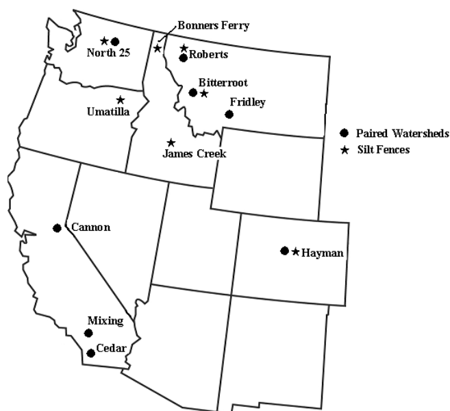
Figure 1. Burned area emergency stabilization monitoring sites in the Western U.S. The Hayman site in Colorado has two paired watershed sites.