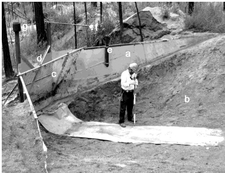
Figure 3. A typical sediment trap and instrumentation: a) sheet metal head wall; b) sediment deposition area; c) trash rack; d) V-notch weir; e) stage gauge; f) ultrasonic gauge to measure depth of accumulation; and g) tipping bucket rain gauge.

To compare data from different sites, past data collection methods were continued (Robichaud and Brown 2002, 2003; Robichaud 2005). Precipitation data (amount and duration) were measured and associated with the resultant runoff, peak flow, and sediment yield measurements for the paired watersheds, and sediment yield measurements for the hillslope plots. The paired watersheds had continuous recording stage and depth measuring devices in the sediment traps (Figure 3). These devices, in conjunction with a v-notch weir, allowed runoff to be accurately measured for each storm. Accumulated sediment was removed from sediment traps at least semi-annually and more often when large events occurred. Sediment was removed from the sediment trap or silt fence area, weighed, sampled, and discarded down slope. Static site characteristics, such as soil properties, topography, and burn severity, were recorded and dynamic characteristics, such as ground cover and water repellency, were measured annually.