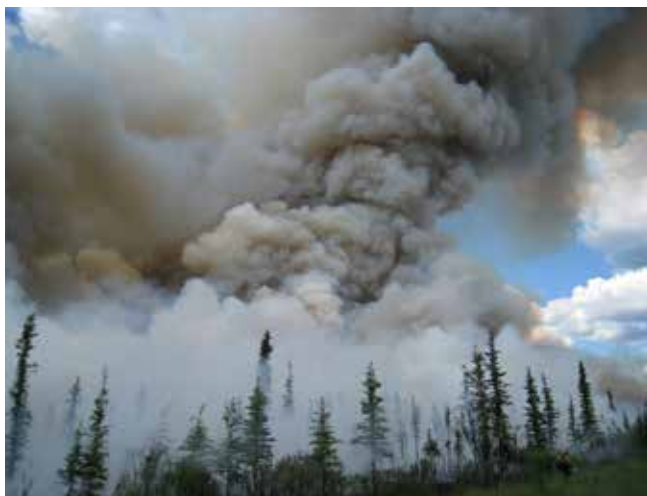
A smoke column develops during an experimental burn outside of Fairbanks, Alaska.

“The boreal forest holds a tremendous amount of carbon, both aboveground in the trees and belowground in the soil.”