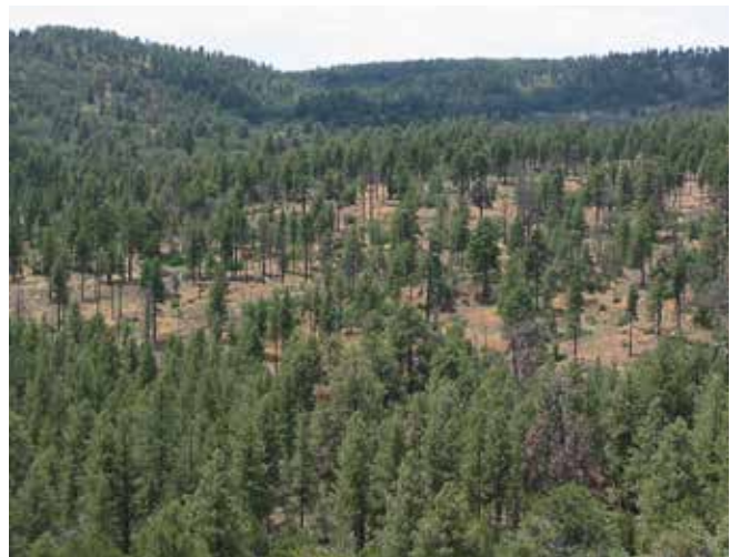
This photo shows the Mount Trumbull Ponderosa Pine Ecosystem Restoration Project in northwestern Arizona. The landscape in the foreground has been treated, whereas the landscape in the middle ground is untreated.

The researchers combined historic data and modeling of future warming scenarios. A modified version of a forest simulation model, the widely used Forest Vegetation Simulator, was used to project