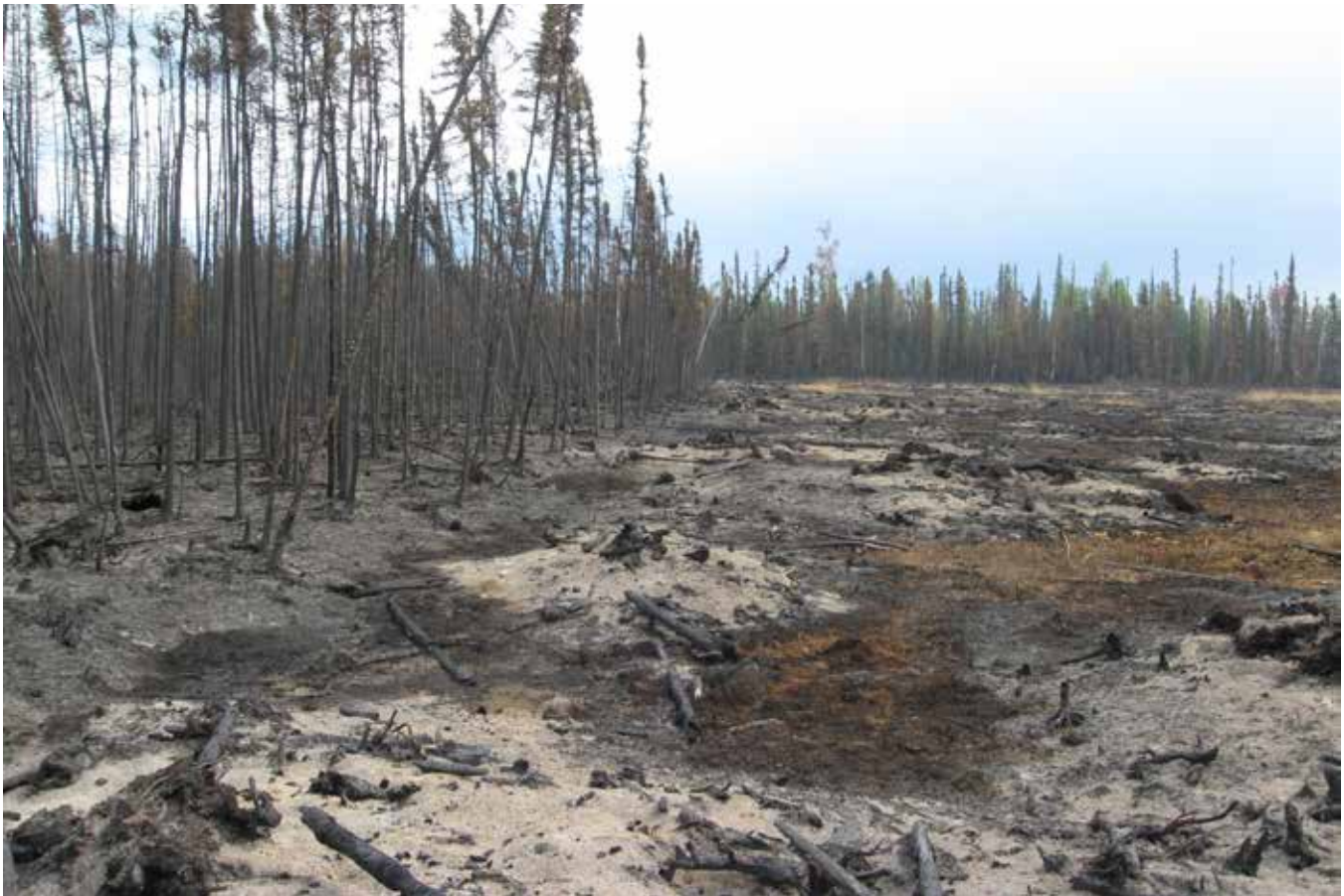
Taken immediately after an experimental burn outside of Fairbanks, Alaska, this image shows the effects of fire inside and outside a fuels treatment plot.