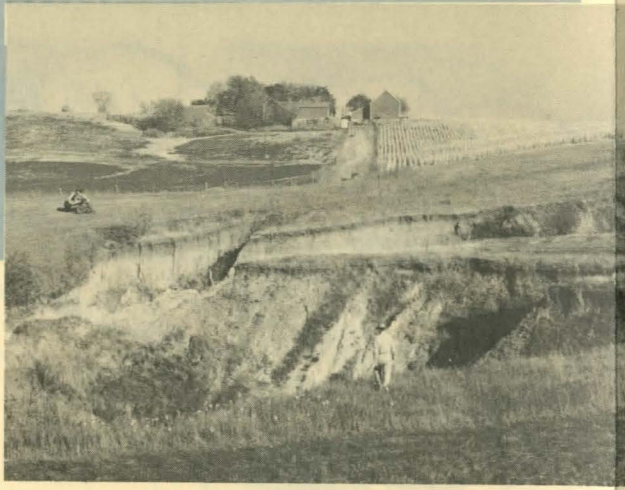
Gully eating away valuable pasture land.