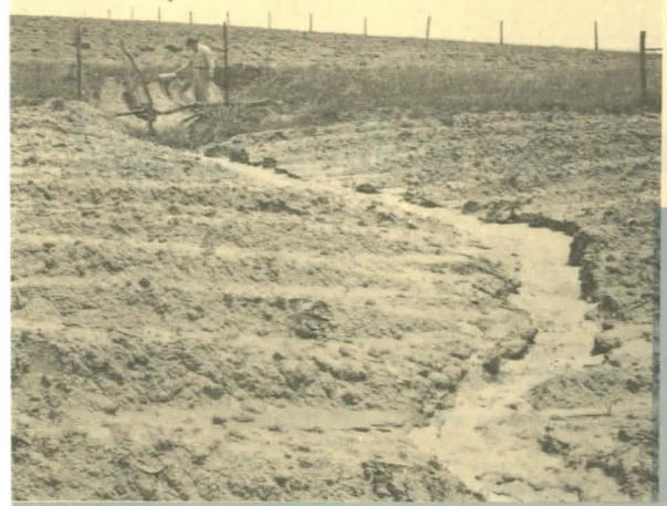
Gully in cultivated land caused by water runoff from bromegrass pasture.