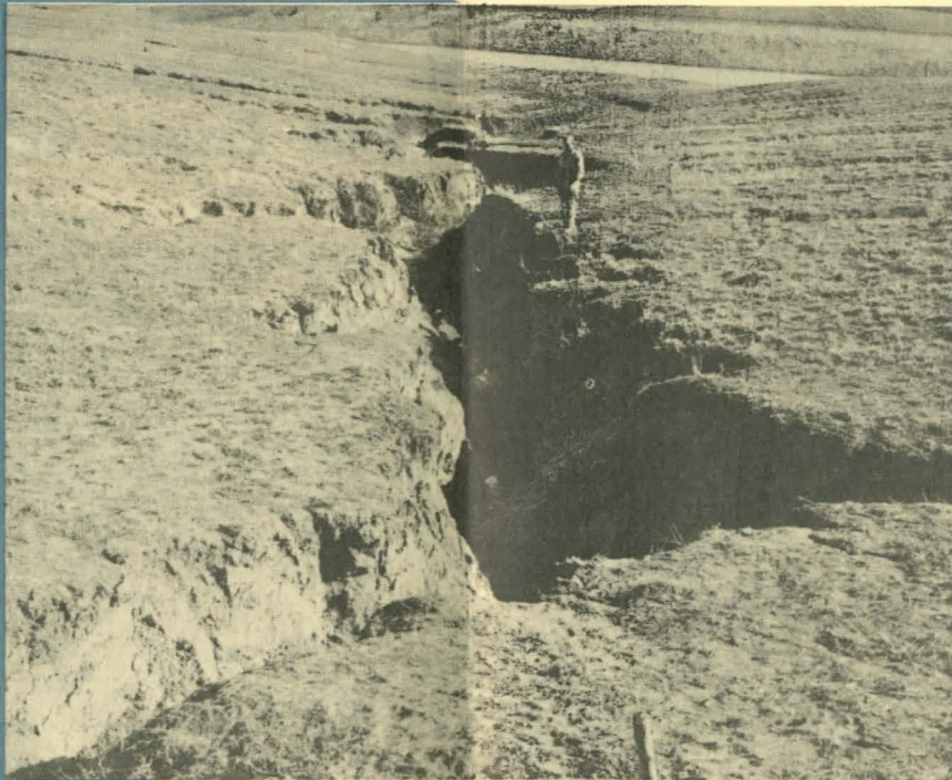
Small gullies, if not stopped, soon become large gullies.