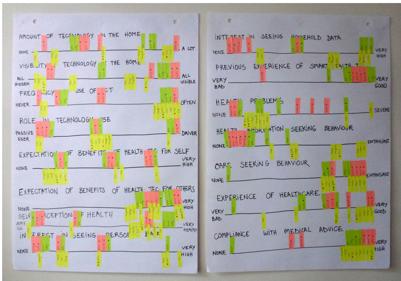
Fig. 2 Participants mapped to attributes

As previously mentioned, the ethnographic study described in this paper was undertaken as part of a large interdisciplinary project, SPHERE, which focuses on the development of new smart home technologies. Alongside gathering and interpreting our ethnographic data, one of the key challenges for the user-centred design team within SPHERE is to communicate these data in meaningful way to the broader team of approximately 40 hardware and