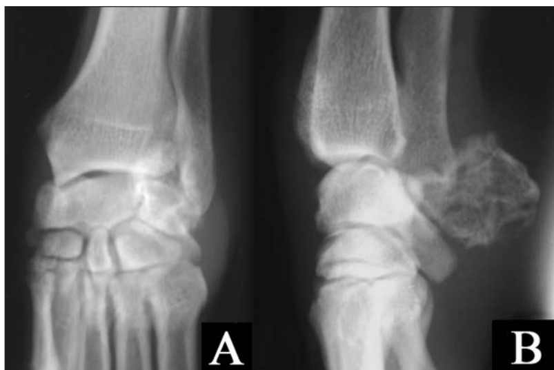
Figure 1—Dorsopalmar (A) and mediolateral (B) radiographic views of the left carpus of a 6-year-old mixed-breed dog with a 6-week history of left forelimb lameness. Notice the monostotic destructive and expansile changes in the left ACB with periosteal new bone formation.