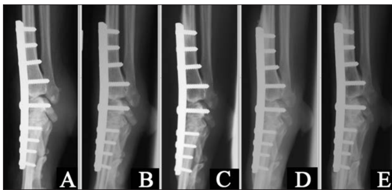
Figure 3—Mediolateral radiographic views of the left carpus of the dog in Figure 1 acquired immediately after (A) and 5 (B), 9 (C), 14 (D), and 30 (E) weeks after left PCA surgery following ACB excision.

weekly examination of the cast and reapplication of cast padding by the referring veterinarian.