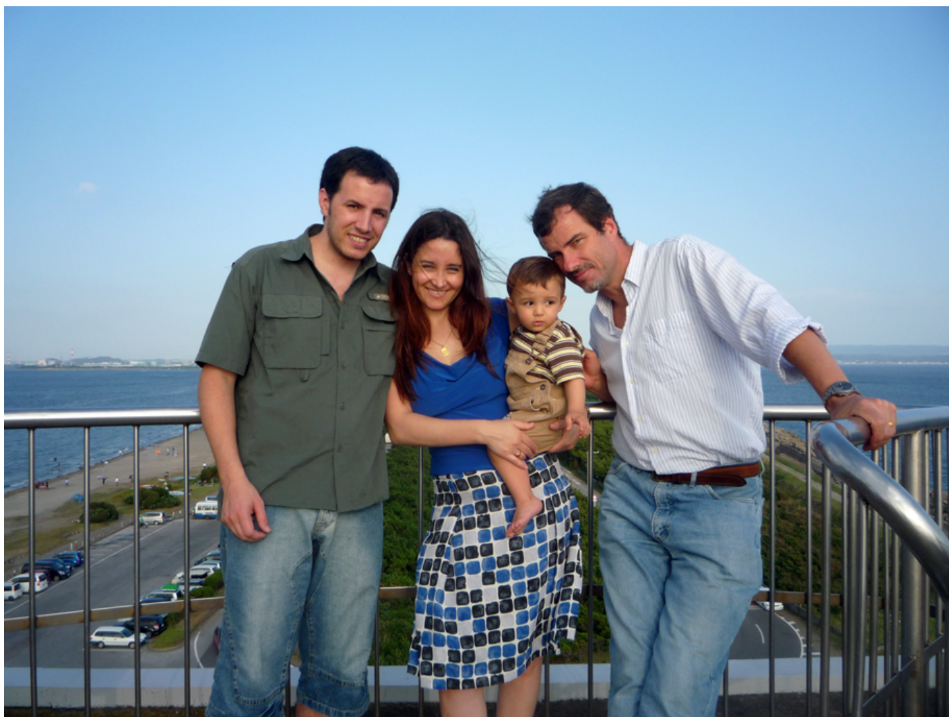
Chiba, bahía de Tokyo, 2008