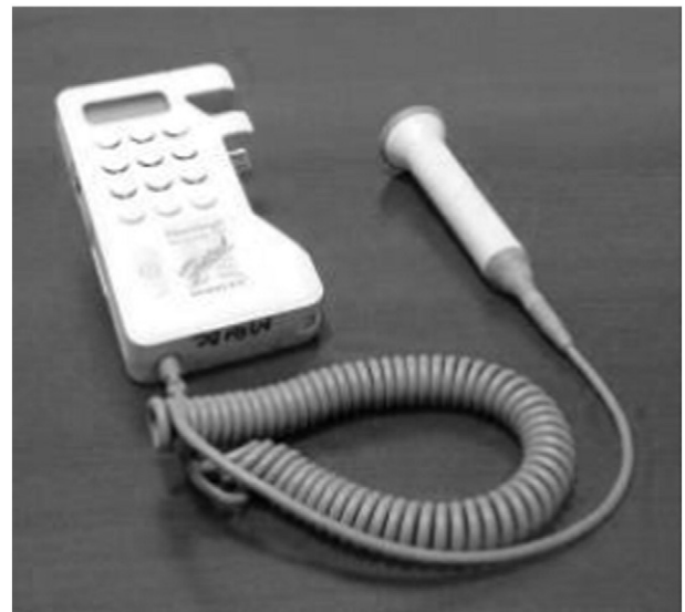
Fig. 4. Handheld Doppler device.

It takes time to develop clinical expertise with intermittent auscultation when performed with a fetal stethoscope [8,9]. Initially it may not be easy to recognize the fetal heart sounds, and later there is a slow learning curve for the identification of accelerations and decelerations. Even for the most experienced healthcare professionals, it is impossible to recognize subtle features of the FHR, such as variability. Using fetal stethoscopes, awkward positions sometimes need to be adopted for effective auscultation and therefore healthcare professionals should ensure good ergonomic position for themselves and the laboring woman when using intermittent auscultation. Also with these instruments, there is no independent record of the FHR and usually no confirmation of the findings by other healthcare professionals, or by those in the room. This may cause uncertainty in case reviews and medico-legal cases.