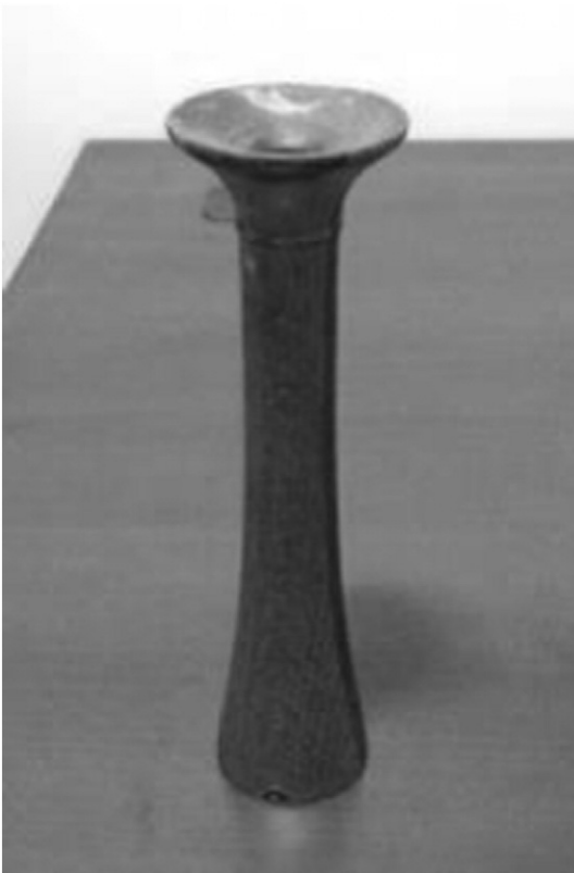
Fig. 1. A Pinard stethoscope.

for CTG monitoring are available, intermittent auscultation may be used for routine intrapartum monitoring in low-risk cases (Table 2). However, approximately half of the panel members believe that continuous CTG should be the option during the second stage of labor, although there is no direct scientific evidence to support this.