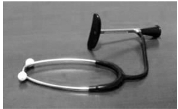
Fig. 3. A DeLee stethoscope.

assessment of other physical parameters such as maternal skin tone, temperature, breathing patterns, direct palpation of fetal movements, and maternal contractions.