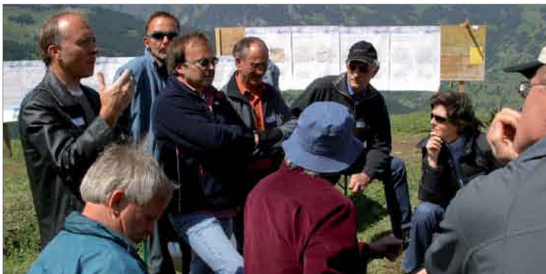
Figure 1: Stakeholder discussion in the Jungfrau-Aletsch-Bietschhorn World Heritage Site

Management of the Jungfrau-Aletsch-Bietschhorn World Heritage Site (WHS) in Switzerland faces a challenge from the interplay of conservation and economic development. Transdisciplinary approaches were used in order to elaborate basic conditions to preserve ecologic stability and inherent natural beauty without preventing sustainable regional development.