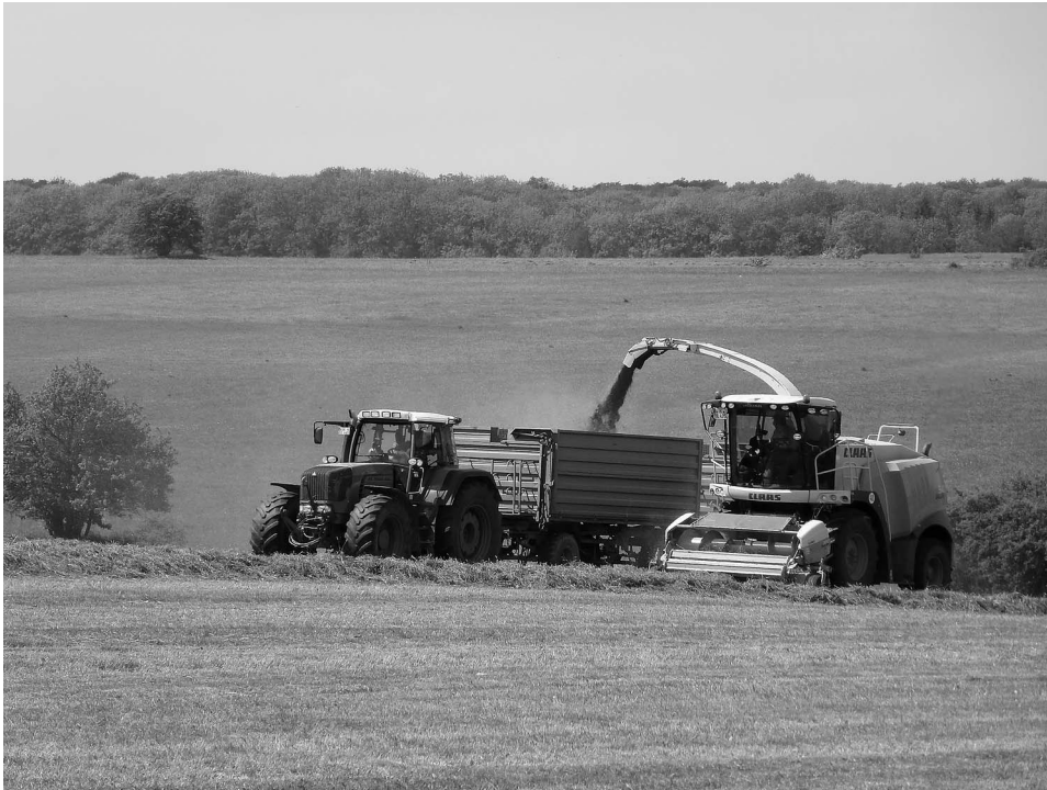
PLATE 1. Increased mowing frequency is an important component of grassland management intensification in central European grasslands.

a negative correlation ( r = -0.52 ) between the percentage difference in richness between high and low LUI and the average correlation strength with other taxa. Observed changes in the correlations between taxa were also strongly correlated with the magnitude of difference in species richness ( r = -0.78 ) and the difference in the standard deviation in richness between high and low LUI ( r = -0.62 ; Table 1); this suggests that the correlation change at high LUI was also driven by biodiversity declines.