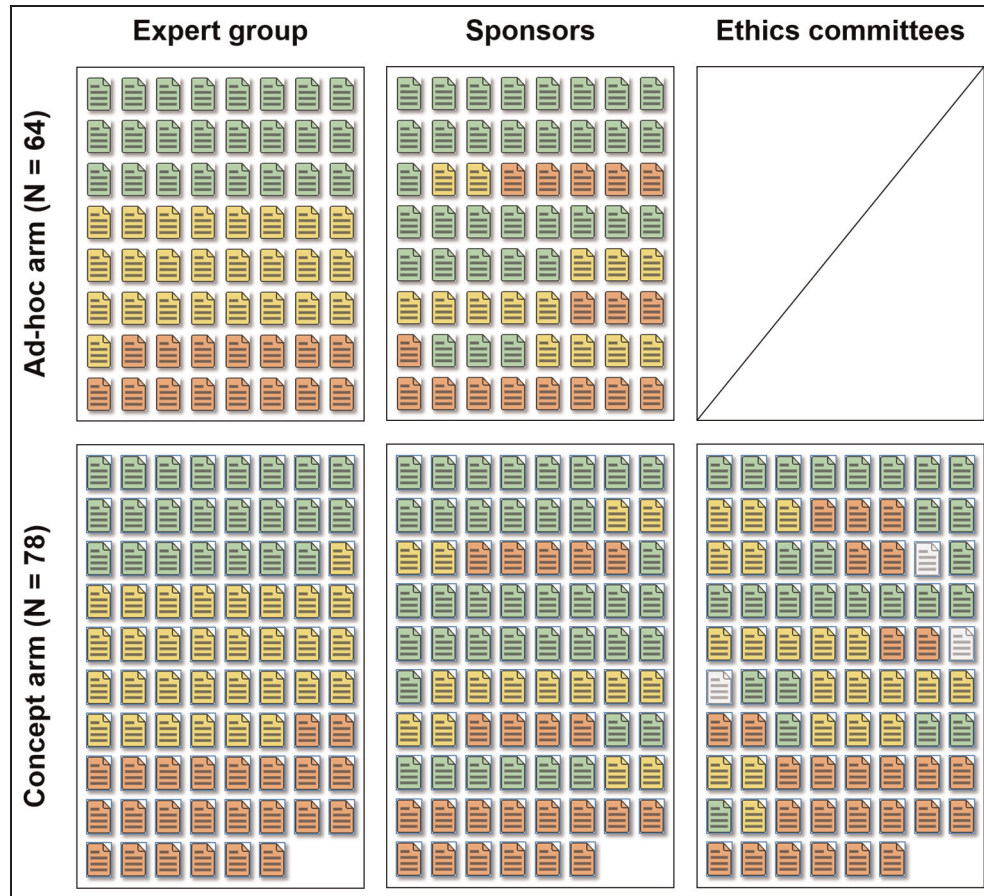
Figure 2. Assessments of individual protocols by arm and group. Each pictogram represents an individual protocol assessed in the trial across groups within each arm. Ethics committees did not assess protocols in the ad hoc arm.

Green protocols: assessed as category A; Yellow protocols: assessed as category B; Red protocols: assessed as category C; Grey protocols: no assessment available.