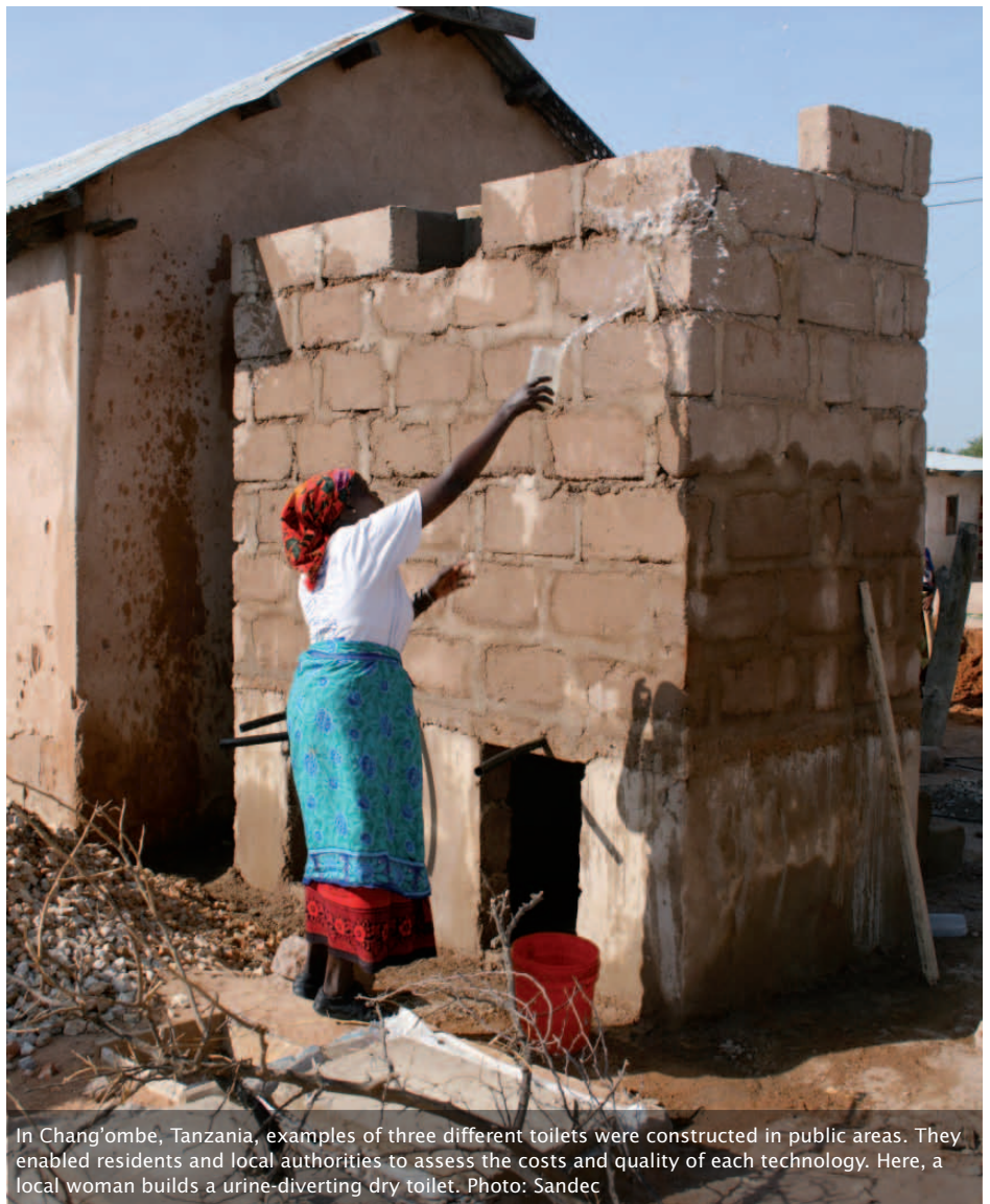
In Chang'ombe, Tanzania, examples of three different toilets were constructed in public areas. They enabled residents and local authorities to assess the costs and quality of each technology. Here, a local woman builds a urine-diverting dry toilet.