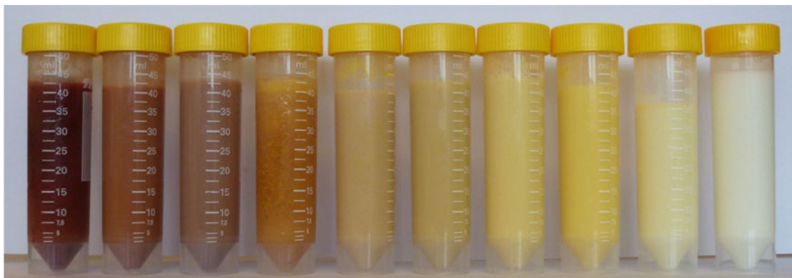
Fig. 1. Spectrum of colostrum colours in dairy cows compared with mature milk (right).

colour system was modified according to the DIN99 formula in order to harmonise sensation of colours (ASTM D2244, 2011).