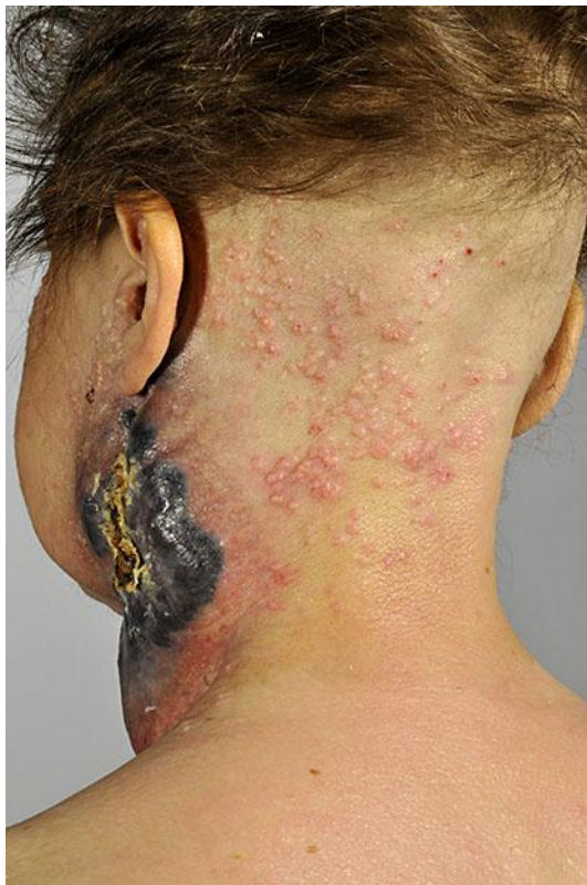
Fig. 1. Development of several epidermal cysts in the head and neck area where a large exophytic melanoma tumor mass had been previously irradiated.