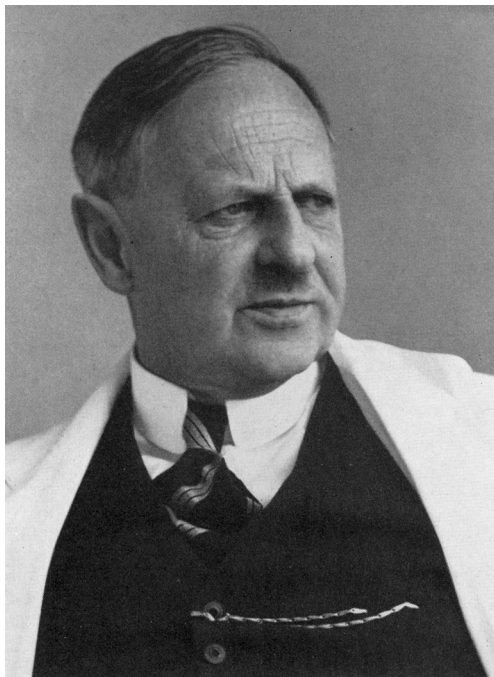
Fig. 1 Hans Brun (1874 – 1946) from [53] (1944)

Only 26 days after the Elsberg/Beer operation, the Swiss surgeon Hans Brun (1874–1946; Fig. 1) performed surgery on a 32-year-old railway employee [55]. In the private hospital "Im Bergli," Lucerne, Switzerland (Fig. 2), he chose a C3–4 laminectomy to remove a solitary tuberculoma of the subpial cervical medulla. Postoperatively, the patient soon recovered