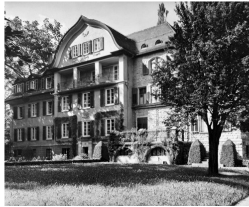
Fig. 2 Photograph from 1920: Brun's private hospital in Lucerne after the expansion

and experienced a marked improvement in his preoperative neurological deficits.