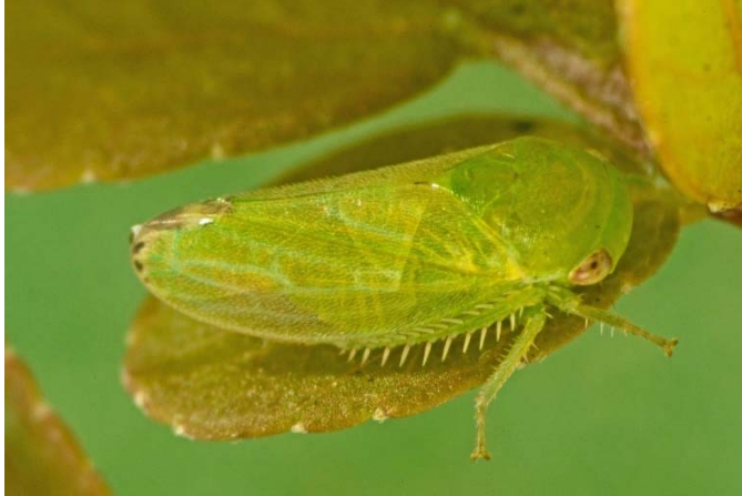
Fig. 8: Penestrangia apicalis (Osborne & Ball) on its hostplant, Heilbronn. Note the dark spots on wing tips, whitish veins and the hair cover on wings.

leafhopper is monophagous on honeylocust, Gleditsia triacanthos L. (Fabaceae), a tree that is native to the east-central United States, but that is widely planted as an ornamental. The species overwinters in the egg stage in twigs of the current season. Nymphs were found between early May and early July, adults between late June and October with a maximum in June and July. The bulk of field data suggest a single generation per year, although there are some late records of ♂♂ which may indicate a second generation.