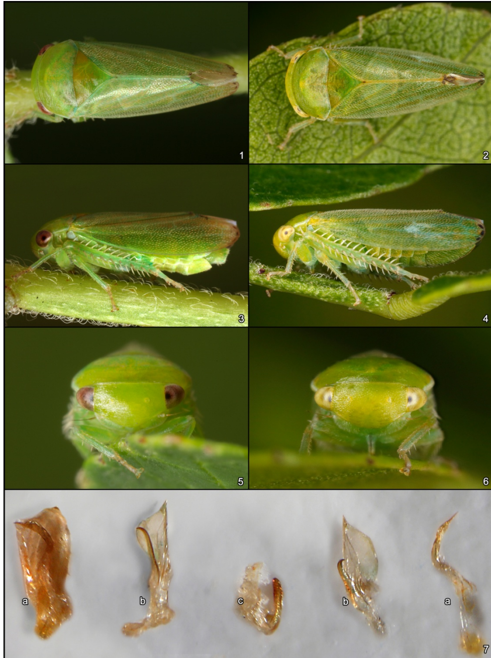
Figs. 1-7: Penestragania apicalis (Osb. & Ball): 1, 3, 5: adult ♂, Freiburg im Breisgau ; 2, 4, 6: adult ♀, Heidelberg. 7: ♂ genitalia, Basel: left and right pygofer appendages (a), styles and genital plates (b), aedeagus (c).