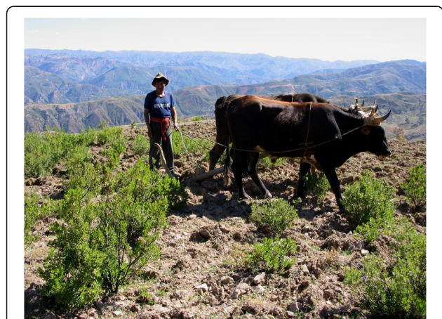
Figure 6 Importance of B. dracunculifolia for the restoration of soil fertility in fallow land.

Local people tended to give higher cultural importance to trees (e.g. S. molle ) than shrubs (e.g. L. graveolens ), as demonstrated by both ethnobotanical indices used (Composite S, CI) (Figure 5). This is supported by another study carried out in the same area [4] that revealed that sociocultural plant values increased with plant height and timber availability. This may be explained by the scarcity of timber needed for fuelwood and construction in the region. However, some frequently-growing shrubs such as B. dracunculifolia were also intensively used as fuelwood, for livestock fences, and in restoration of soil fertility in fallow land (Figure 6), and were thus highly valued by local people. This suggests that cultural importance and use-values of woody plants may not depend on their life-form only, but rather on their availability and accessibility (see also [4,8,9,46], especially in the case of frequently-used fuel plants [47]. Furthermore, plants' specific attributes (e.g. hard wood, tasty fruits) that exclusively meet important subsistence needs increase their cultural importance [10]. S. molle ,