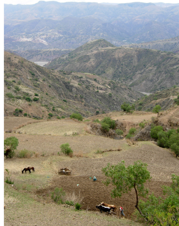
Figure 4 Landscape of the research area.

Farming is complemented by temporary and permanent off-farm activities in the lowlands and urban centres.