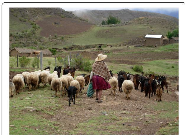
Figure 1 Livestock rearing.