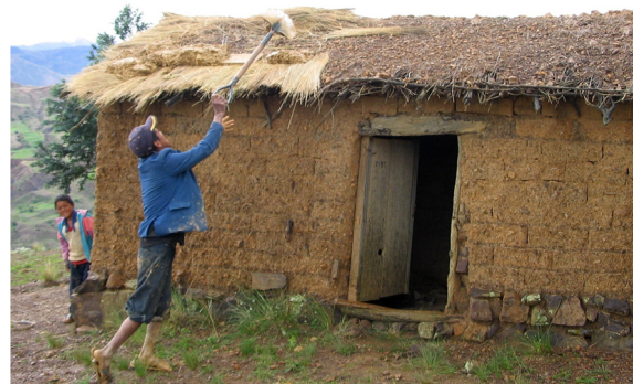
Figure 2 Reparation of roof cover by using woody branches, straw and loam. Photograph by R. Brandt.

dynamic values. They transform over time and thus may vary from one generation to the next due to abrupt or gradual changes in how people use or do not use plants in changing living conditions [10,35]. In the Bolivian highlands and lowlands, rural out-migration to urban centres strongly influences peasants' livelihoods. Young adults in particular migrate to seek better income and access to basic services such as healthcare, education, and infrastructure [36]. These processes can increase the generational differences in plant-related knowledge and valuation, and can also cause loss of traditional knowledge among the youth [37,38].