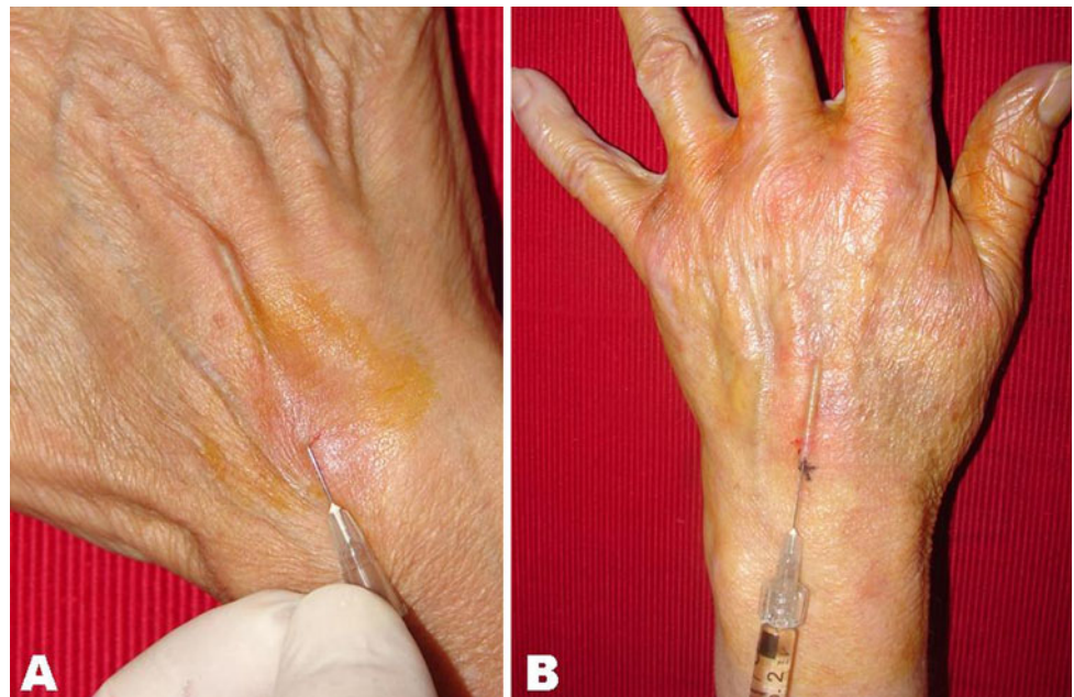
Fig. 1 a Control of the cannula in the space noticed between the tendons. b HA injection using gentle longitudinal swing-like movements

persistent ecchymosis, edema, pain, hyperpigmentation, and prolonged alterations in sensitivity. During each follow-up the patients were evaluated independently by three surgeons: two plastic surgeons and a vascular surgeon in the same clinic. Aging aspects were assessed using the following criteria: clearance of rhytids, veins, bony prominences, and clearance of dermal and subcutaneous atrophy. Using a visual scale, each criterion was then scored by the three evaluators, who did not consult among themselves, and the surgeon who performed the procedure. Results were ranked as excellent: 90–100 % clearance, good: 70–89 % clearance, regular: 40–69 % clearance, and poor: 0–39 % clearance. At the end of the consultation, the results were collected and shared and a final mean was calculated for each patient. At the first follow-up 2 weeks after the procedure, ultrasound (SonoSIT MicroMAxx, SonoSite Inc., USA with transducer L38, 10–5 MHz) was carried out. The ultrasound criteria used to determine that there was insufficient filling were inhomogeneous distribution of the HA in the intermetacarpal space or non-symmetrical filling compared to the contralateral side. Ultrasound confirmed the residual skin laxity and fat atrophy and the injection was repeated in the incompletely filled area to achieve optimal results. Ultrasound confirmation permitted precise injection of the amount of HA needed and avoided the typical aspect of dorsum edema after treatment.