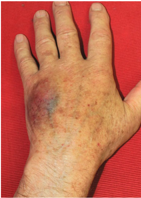
Fig. 6 Mild ecchymosis occurring after HA injection at the level of the fourth intermetacarpal space