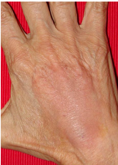
Fig. 7 Mild ecchymosis occurring after HA injection at the level of the second and third intermetacarpal spaces

parameter. The p values for the paired t tests were 2 weeks versus 1 month: 0.044, 2 weeks versus 3 months: 0.160, and 2 weeks versus 6 months: 0.003.