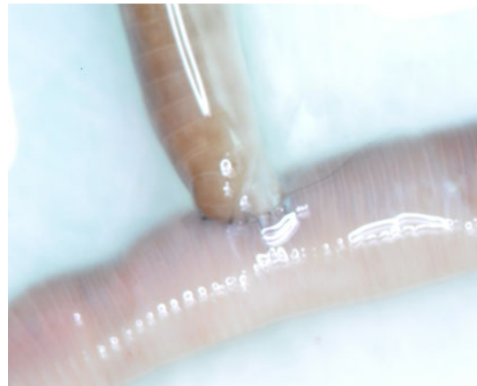
Fig. 2 Result after microsurgical end-to-side training (diameter = 2.2 mm, magnification \times 40 ) and permeability test conducted by injecting water into the earthworm using a syringe

The subjective evaluation of training is presented in Table 2. The study noted a subjective improvement for all subjective criteria, especially for the group in which size was < 1 mm.