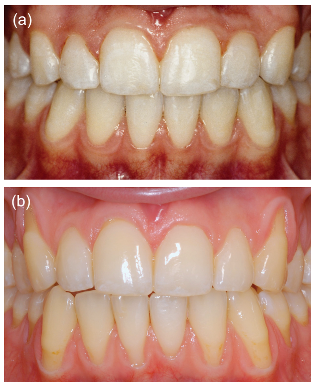
Figure 1 Development of labial gingival recessions after orthodontic treatment: (a) immediately post-treatment and (b) 5 years later.

Although other experiments were less unequivocal (Nyman et al. , 1982), it seems possible that labial movement of incisors in humans may be a risk factor for gingival recessions. Several studies addressed this problem, but their conclusions were contradictory. Some publications showed association between incisor proclination and development of recessions (Årtun and Krogstad, 1987; Allais and Melsen, 2003; Yared et al. , 2006) and others demonstrated the lack of such correlation (Ruf et al. , 1998; Djeu et al. , 2002). Most of them, however, assessed periodontal status immediately or within a few months after orthodontic therapy.