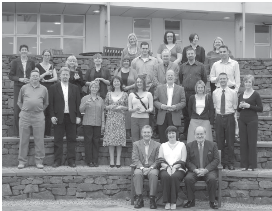
Education developers from Scotland enjoying a break at their Summer Conference at Sabhal Mor Ostaig College in Skye.

NB SEDA members automatically receive copies of Educational Developments .