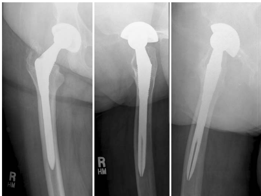
Fig. 3 The anteroposterior (a), lateral (b) and false profile (c) radiographs of 68-year-old patient 8 years after primary total hip prosthesis are shown. Although excessive polyethylene wear is visible, there is no evidence of osteolysis around the femoral or the acetabular component

hypothesis that states that the specific features of the described stem leads to an absence of intraoperative femoral fractures, a lower incidence of activity-related thigh pain and femoral hypertrophy in comparison to other second-generation stems (Table 9). The disadvantages of this second-generation hip prosthesis are the necessity of the additional machining of the metaphysis in comparison to the broaching-only technique. This requires further technical skills for the surgeon that can lead to an increased operation time.