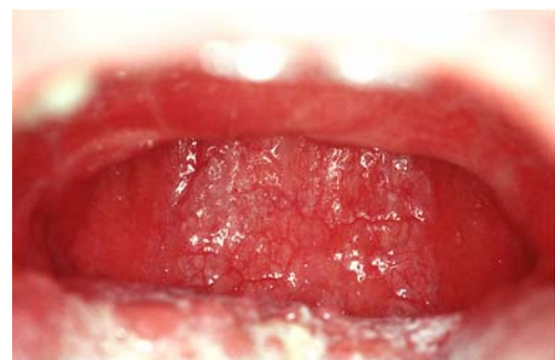
Fig. 3 The postoperative site with wide pharyngeal opening

The age distribution of the patient population in this retrospective long-term evaluation after modified UPPP in patients with habitual or complicated rhonchopathy does not reflect the increasing prevalence of rhonchopathy with age [10, 11]. Younger patients asked for therapy more often than older patients. Self-selection and referral bias must be assumed to be the reason. Male sex is a major risk factor for rhonchopathy, as reported