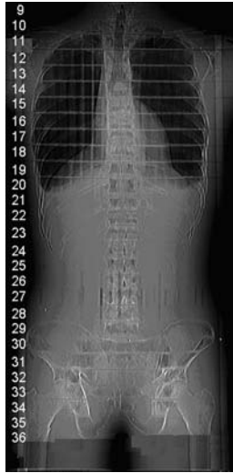
Figure 1. Topogram of the Alderson phantom (without head) with slice numbers.

The TLDs were stored at room temperature for 12 h after each radiation exposure and then heated again for 10 min to 100°C (pre-annealing) before they were evaluated. They were then read out within the following hours. A Harshaw-type 5500 TLD automatic reader was used for this purpose.