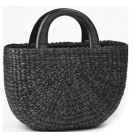
Figure 10: Bag made using water hyacinth

The C content of the aquatic biomass could be converted into more stable biochar, which can be locked beneath the soil for several years through agricultural applications. Reports are available on biochar production from aquatic weed Eichornia crassipes (water hyacinth)[26]and other feed stocks [27, 28]. Besides, reports are available on the bioconversion of aquatic biomass into bioethanol [29, 30]. Cellulosic content of the aquatic biomass can be converted to glucose followed by