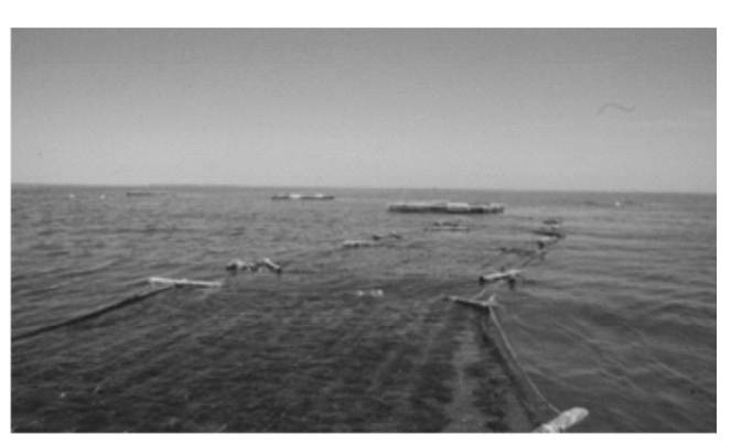
Figure 7: Sea weed culture integrated to cage farming by CMRFI, Mandapam Research Centre

Integrated Multi Trophic Aquaculture (IMTA) is another emerging and potential area that could be