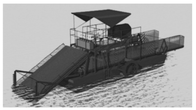
Figure 8: Aquatic Weed Harvester

The spread of aquatic weeds poses serious damages leading to degradation of several regional wetlands. Extend and type of aquatic vegetation can be considered as an indicator of the aquatic pollution level. In India, aquatic vegetation accounts for around 9 and 14% of total wetland area in post monsoon (1.32 mha) and pre monsoon (2.06 mha) respectively [6]. It has to be pointed out that the regional impact of aquatic vegetation over wetland shall be much higher. The uncontrolled excessive