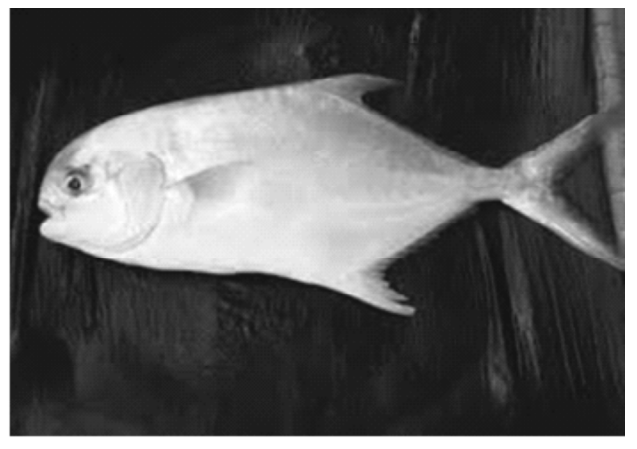
Figure 4: Silver pompano Trachinotus blochii [17]

Though scientifically studied regional wetland 'Kottayam chira' of Kerala [13,14] was subjected to the restoration efforts through the 'Sahasra sarovaram' project of the state government, the aquatic weed removal and desiltation were not effectively attempted at the implementation phase. This highlights the necessity of incorporation and close monitoring by scientific body throughout the restoration stages, which could advocate the need to focus on the health and habitat of the ecosystem. In the Ramsar guidelines long-term stewardship was mentioned as one among the principles for wetland restoration. We envisage incorporation of scientific fishing project as a long term stewardship to monitor and conserve the regional wetland ecosystem as well as to enhance climatic resilience of fisheries sector. Feasibility and guidelines for development of suitable fish farming practices could be offered by the scientific bodies. Vulnerable or affected communities due to climate change can be given priority to get associated with