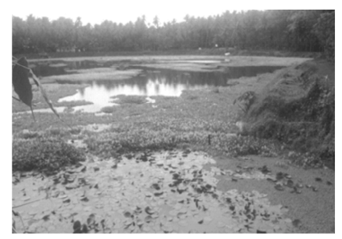
Figure 3: Degraded wetland of Kannur district, Kerala.

quantitative assessment. The proposed model helps in the continuous eco health monitoring of the regional wetlands. Regional degraded wetland resource mapping could be attained by Geospatial techniques which shall favours further eco management plans.