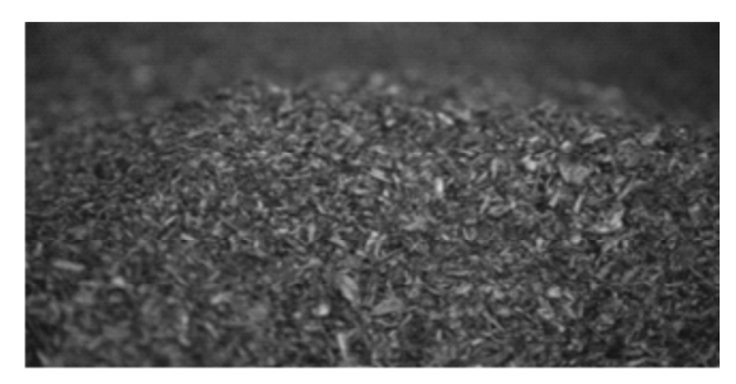
Figure 9: Biochar from biomass

growth and spread of aquatic weedssuch as water hyacinth (Eichornia crassipes)reduces the dissolved oxygen content, favours the development of anaerobic conditions, makes the habitat unfit for the aquatic lives and thereby eventually leads to the degradation of regional wetland ecosystem. The spread of aquatic vegetation also causes hindrances to the fishing practices and thus induces negative impacts to the livelihoods of dependent fishermen. Removal and control of aquatic weeds is a challenging necessity towards restoration efforts. Application of herbicides is not sustainable and alternative means needs to be preferred. Though manual removal is tedious and futile, the utilization of equipments such as 'aquatic weed harvesters' shown in figure. 8 are promising and can be considered. The equipments are effective in removing floating as well as submerged aquatic vegetation to the shore.