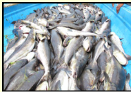
Cage harvested cobia