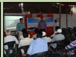
Awareness programme at Veraval