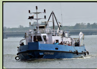
Fishing Vessel Silver Pompano procured under NICRA