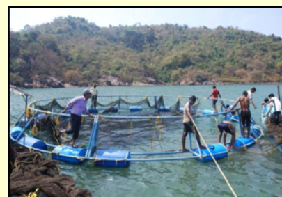
Cage Culture Demonstration

ation with state government of Goa are being carried out actively by Karwar Research Centre of CMFRI.