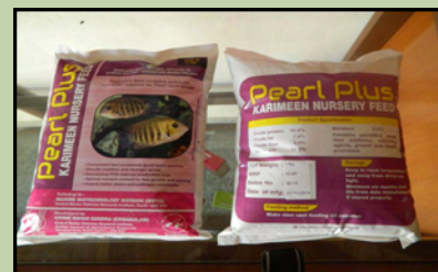
Pearl Plus: Formulated Feed