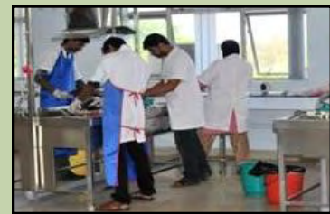
Central Fishery Biology Lab Established at CMFRI Headquarters.