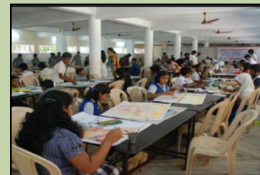
Climate Change Awareness Workshop at Alleppey, Kerala.