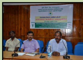
Entrepreneurship Development Programme at Kochi