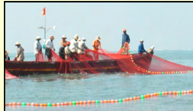
Ring seine operation