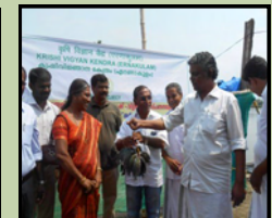
Farmgate Inauguration at Kochi