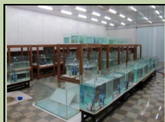
Environmental Chamber at Mandapam Regional Centre.