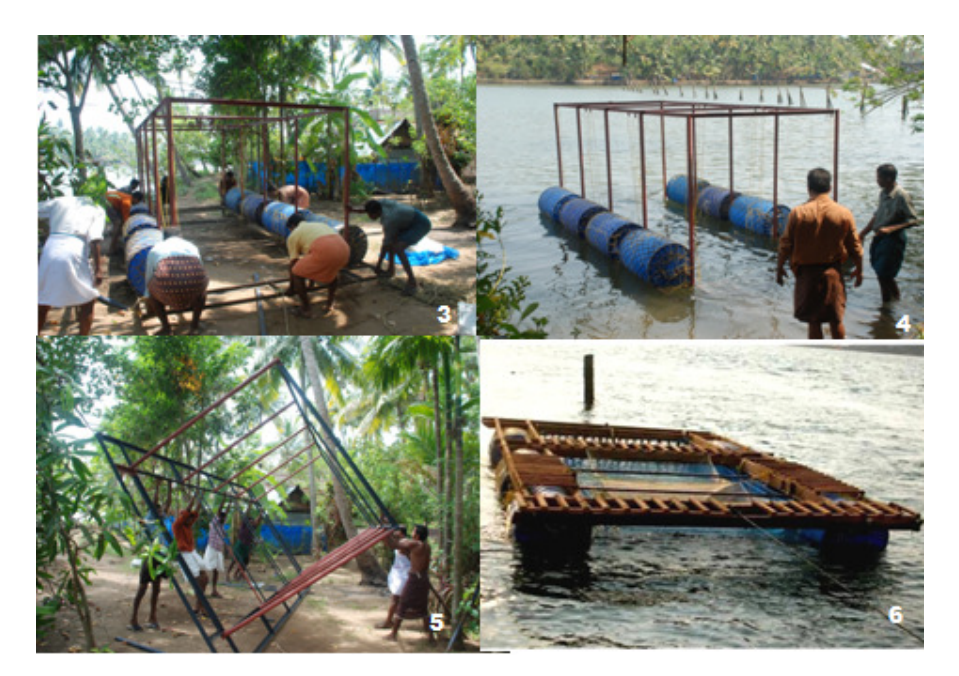
Fig 3-5: Fabrication of the "Microsate" cage by the fisherfolks Fig 6: "Microsate" cage floating in the water body