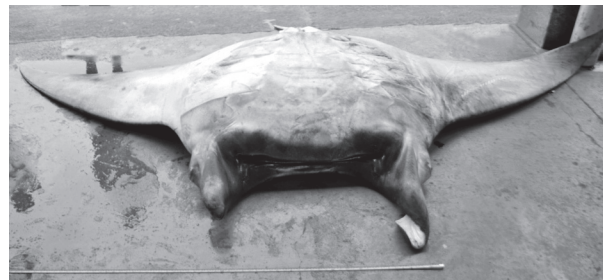
Fig. 1. Giant Devil Manta ray Manta birostris landed at Cochin Fisheries Harbour

Two specimens of giant devil ray, Manta birostris locally known as 'Aanathirandi' measuring 307 and 194.5 cm in TL, 534 and 416 cm in disc width and weighing about 780 and 570 kg respectively were landed at Cochin fisheries harbour on 19.05.14 and 20.05.14 (Fig. 1). Manta birostris are caught generally by gill net and on this occasion these rays were caught from the inshore waters off Cochin at 9°52'N., 9°56' E at a depth of 30-40 m by purse seiner boats. Along the Indian coast, landings of devil