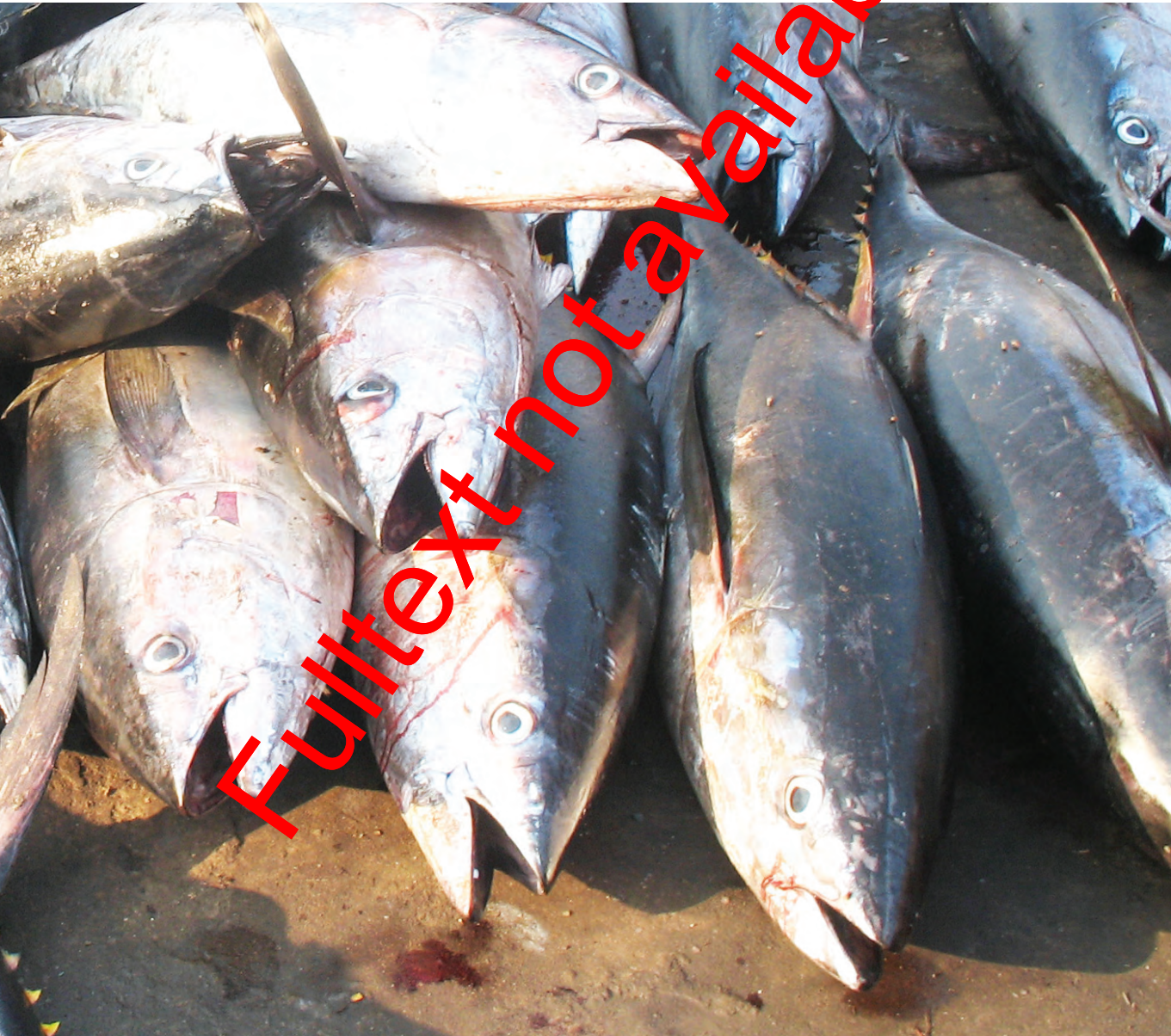
Landings of yellowfin tuna at Neendakara (Kollam )Fishing Harbour