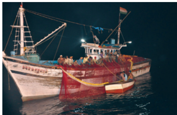
Fig. 3. Purse seine net operation off Mangalore by MV Angel with light

use of light enables concentrating them and capturing large quantities in a relatively short period of time. Purse seining with light is an option in coastal areas while hook and line operation can be considered as an accompanying gear during light assisted squid fishing in oceanic grounds. However, care should be taken to avoid the incidental catch/by-catch of small sized and immature aggregating juveniles or non-commercial groups which may be attracted to the light. Furthermore, caution has to be exercised in determining the number of light fishing units in each fishing zone otherwise it may lead to over exploitation of resources.